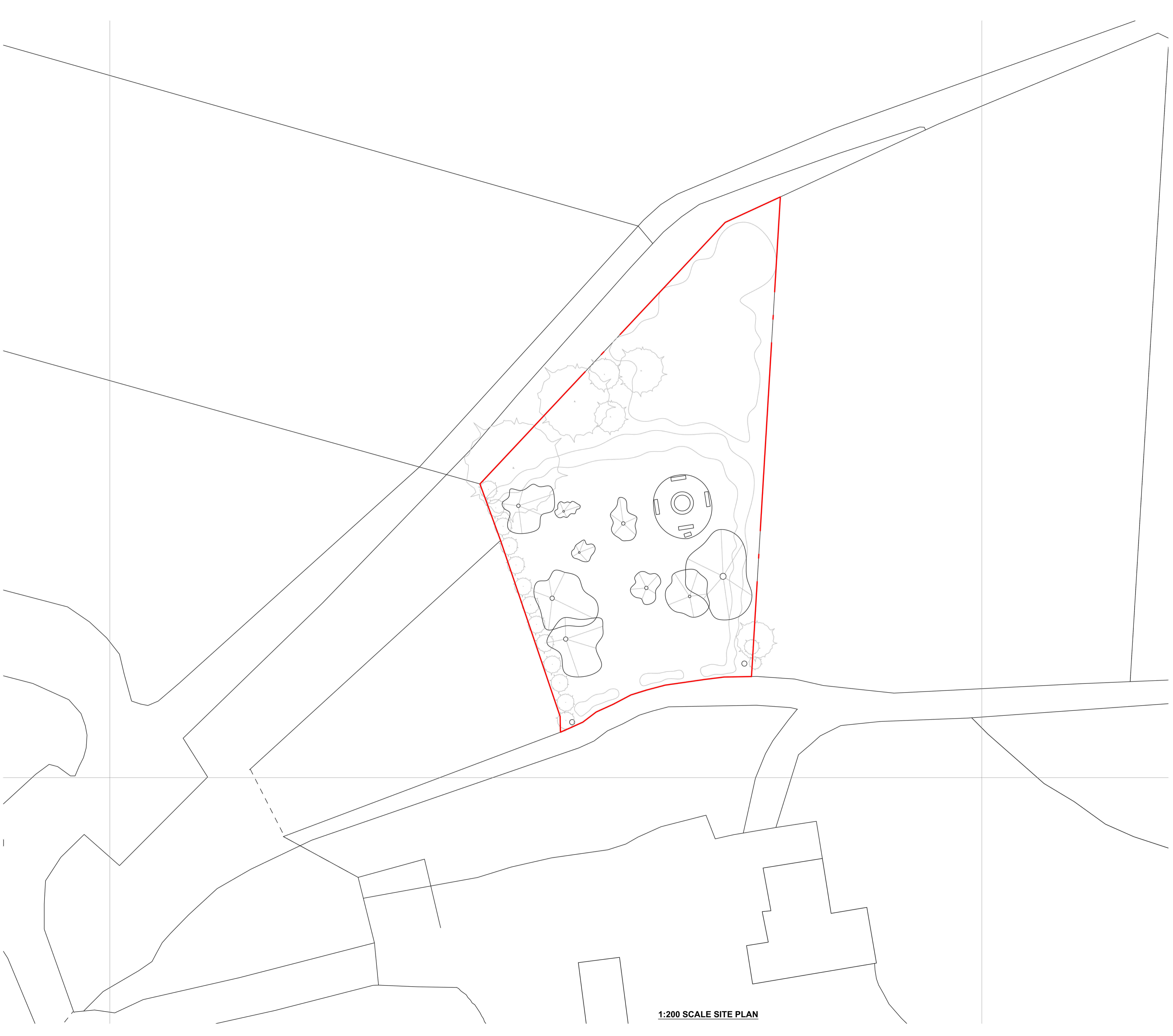
1:200 SCALE SITE PLAN

© david paton building consultancy DO NOT SCALE FROM DRAWINGS, IF IN DOUBT ASK.