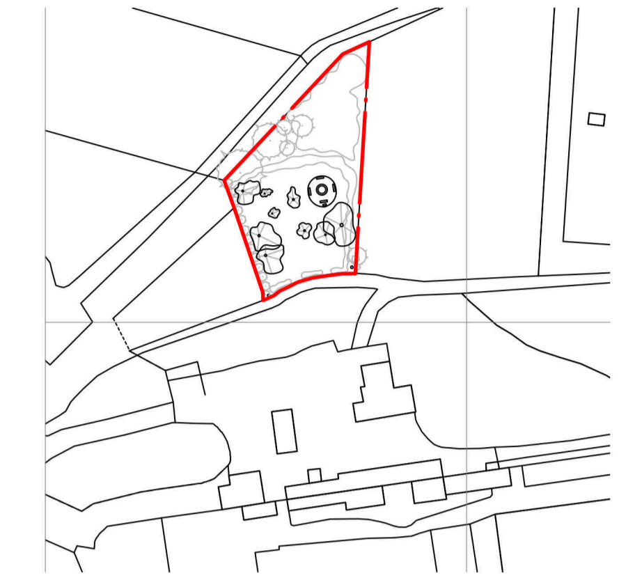
1:1250 SCALE LOCATION PLAN

© david paton building consultancy DO NOT SCALE FROM DRAWINGS, IF IN DOUBT ASK.