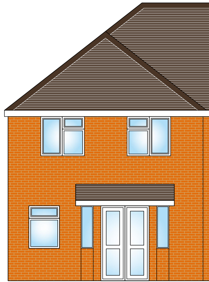
Existing Rear Elevation 1:50 @ A1