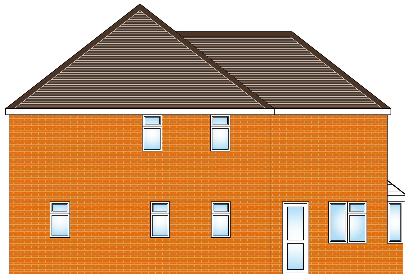
Existing Side Elevation 1:50 @ A1