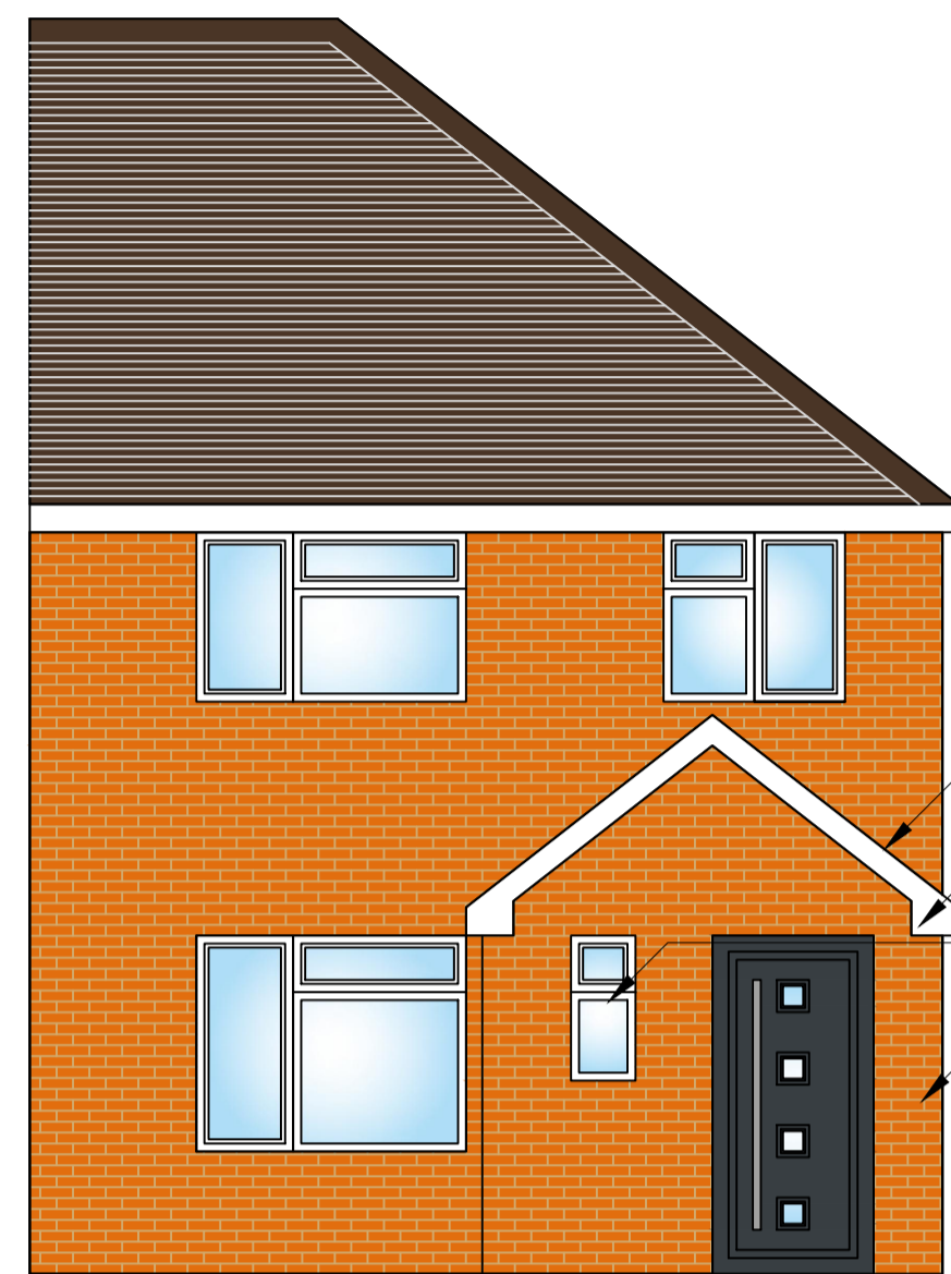
Proposed Front Elevation 1:50 @ A1

Notes: Xref: @ 0,0,0 Site Address: 31 Orchard Way Churchdown Gloucester GL3 2AP