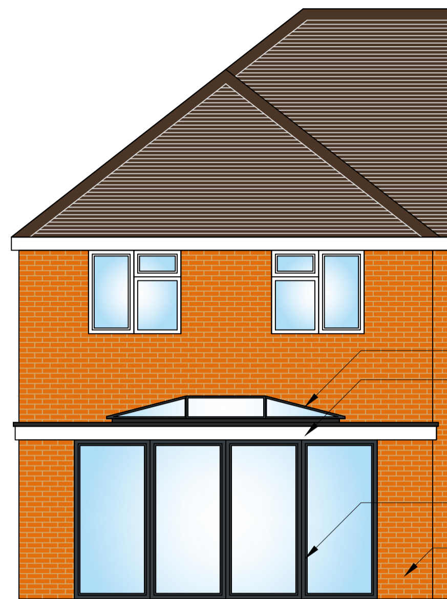
Proposed Rear Elevation 1:50 @ A1