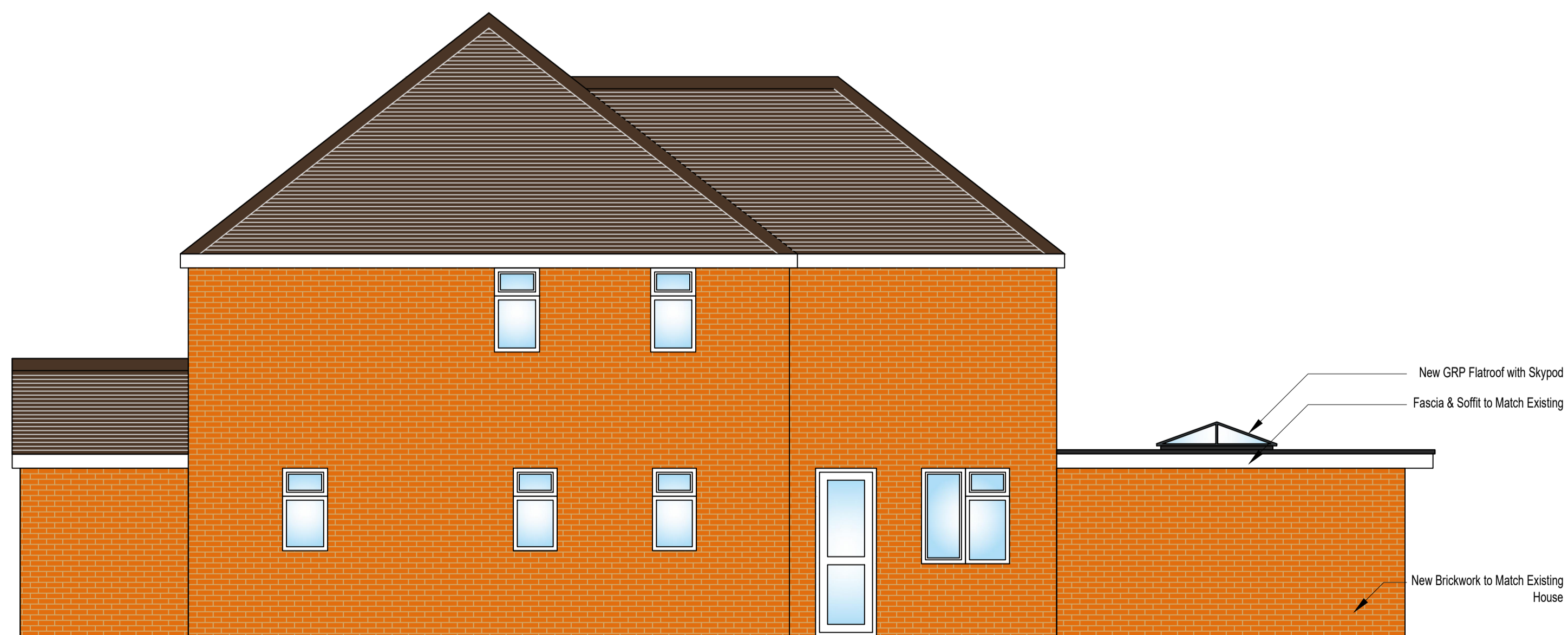
Proposed Side Elevation 1:50 @ A1