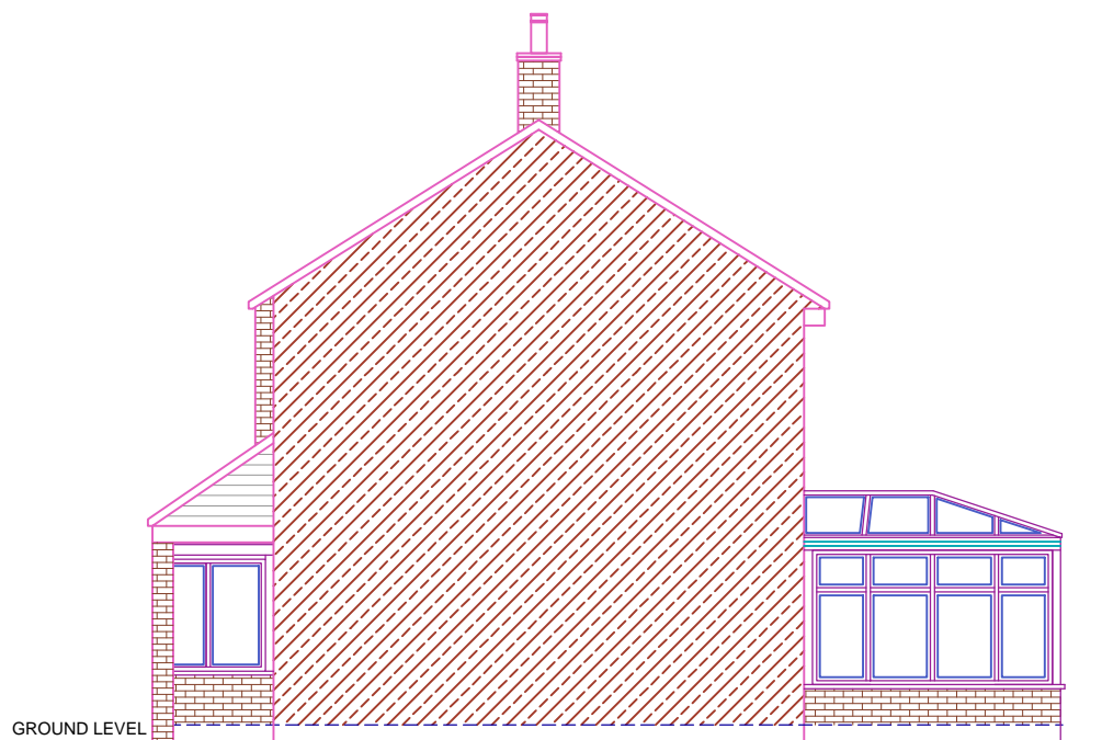
EXISTING ELEVATION SIDE A