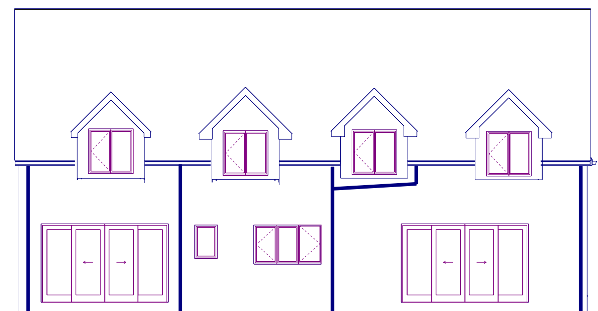
REAR SOUTH SCALE: 1:100

If the works come under the Party Wall by working on or near a boundary notice to be served in accordance with the Party Wall Act 1996 prior to works being carried out. Care must be taken to avoid damage to neighbours property and any damage made good.