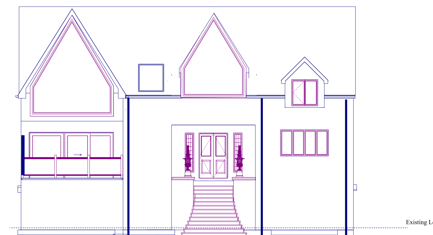
FRONT NORTH SCALE: 1:100