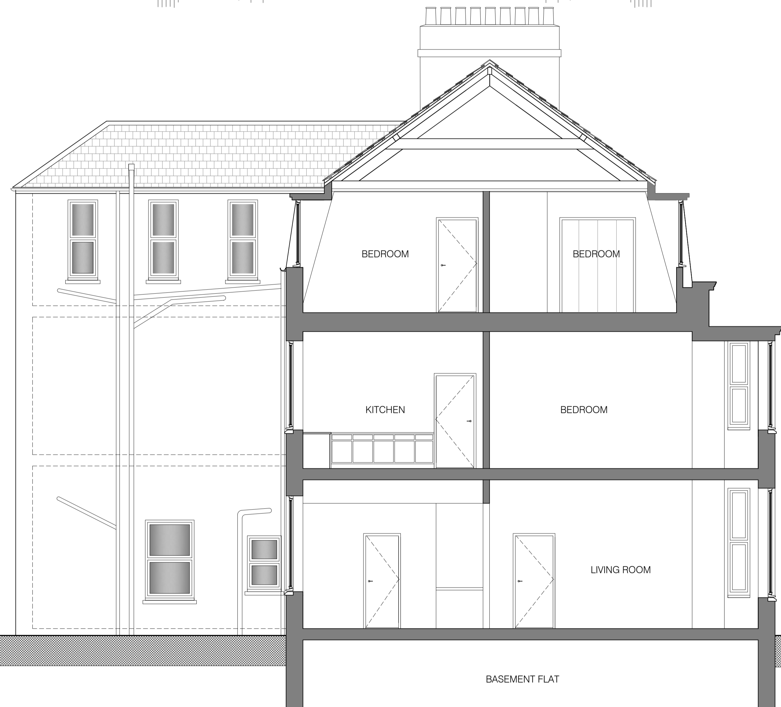
EXISTING CROSS SECTION / SIDE ELEVATION 1:50