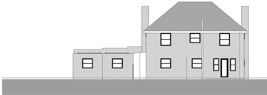
2 EXISTING ELEVATION 2 1:100