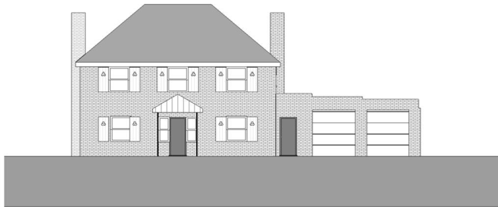
3 EXISTING ELEVATION 3 1:100