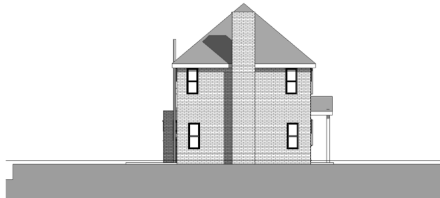
4 EXISTING ELEVATION 4 1:100