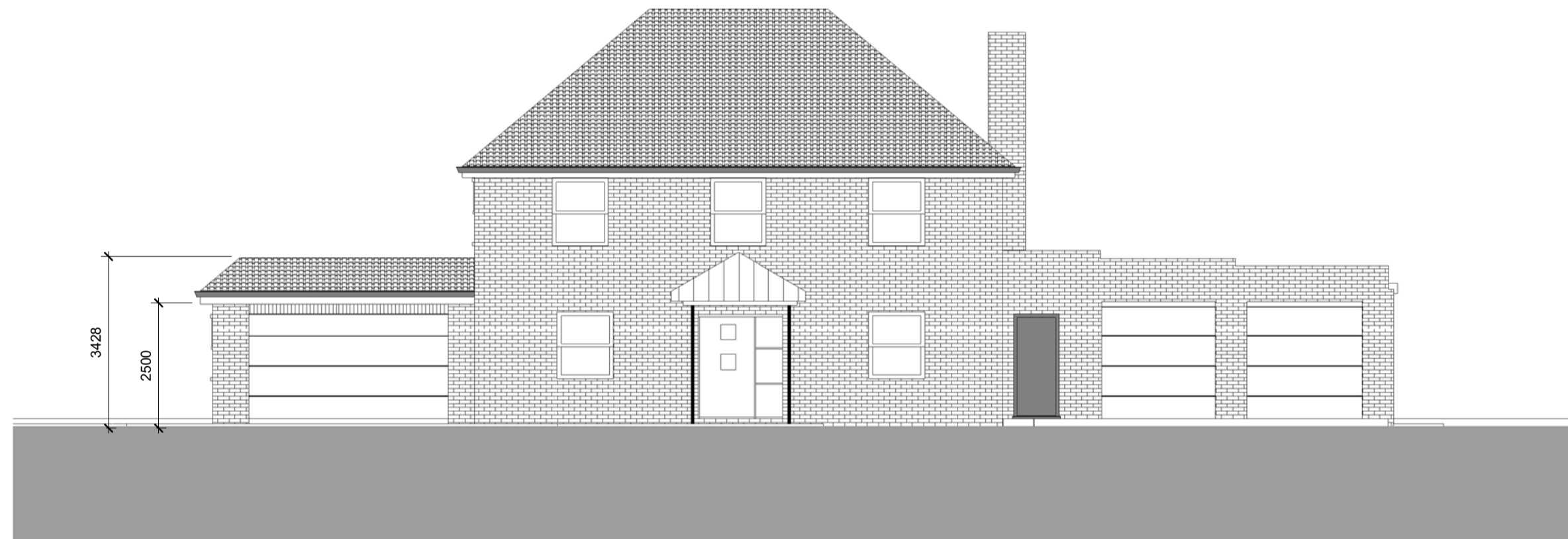
3 PROPOSED ELEVATION 3 1 : 100