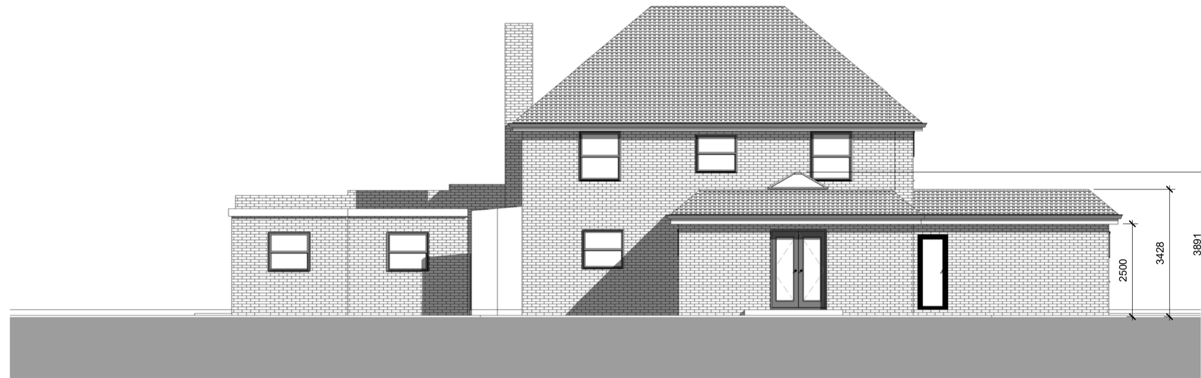
2 PROPOSED ELEVATION 2 1 : 100