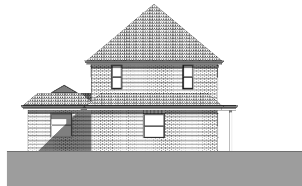
4 PROPOSED ELEVATION 4 1 : 100