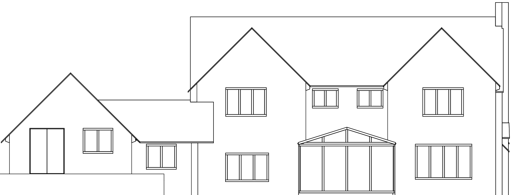
EXISTING SOUTH ELEVATION - 1:100