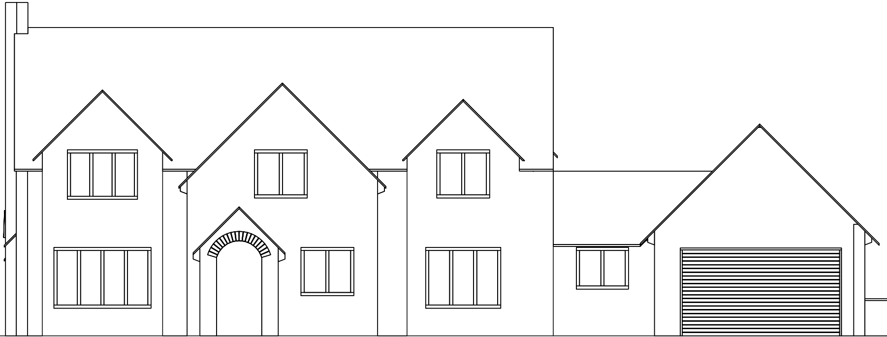
EXISTING NORTH ELEVATION - 1:100