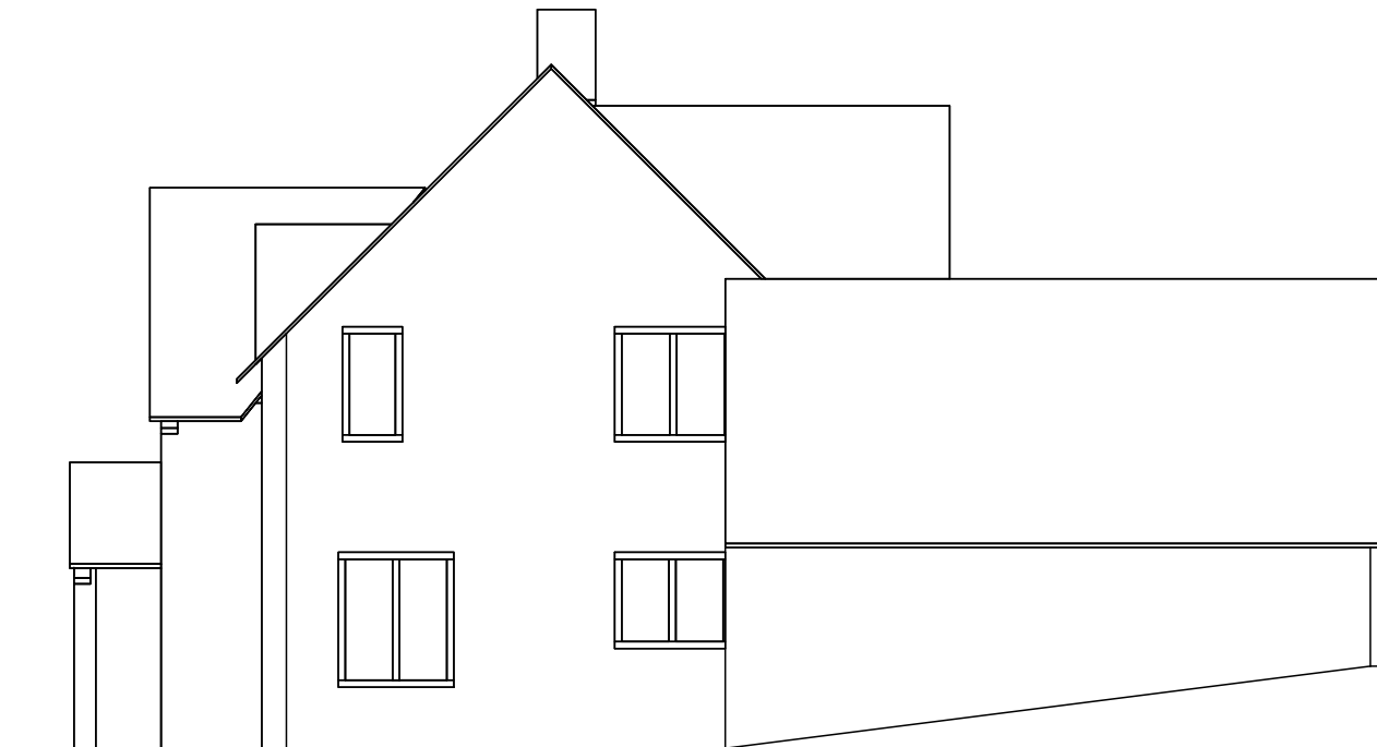
EXISTING EAST ELEVATION - 1:100