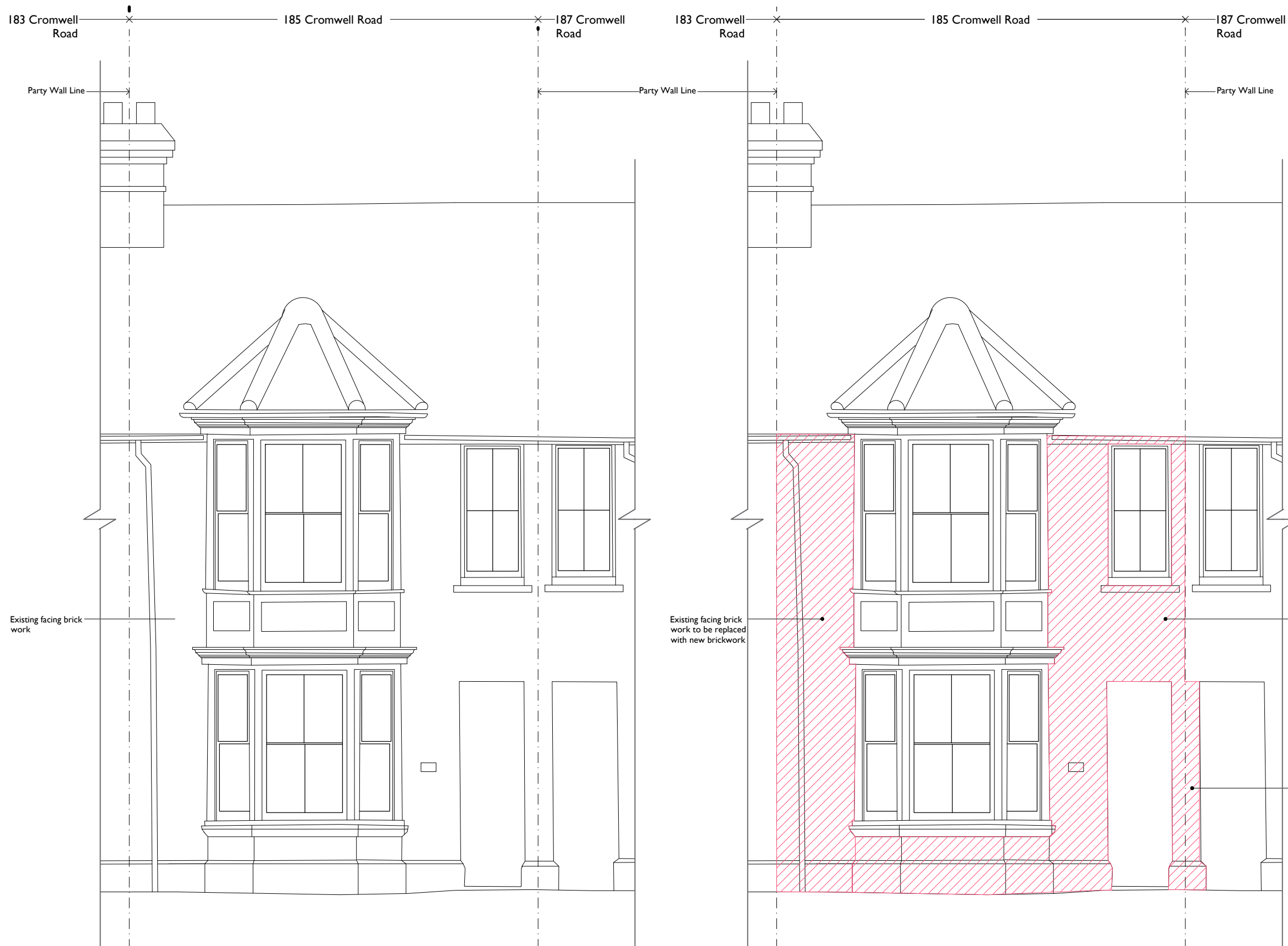
Existing Front Elevation Scale 1:50 @ A3