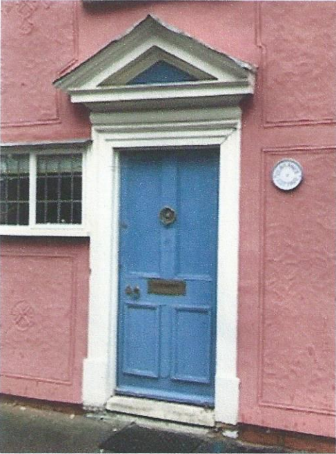
Front door and detail

Pictures show front door in detail and proposed rear veranda area