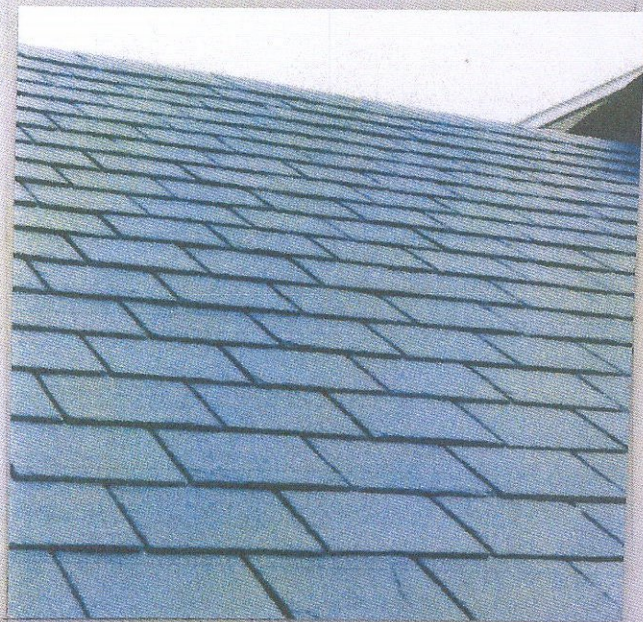
PROPOSED BLUE GREY SLATE ROOFING TILES