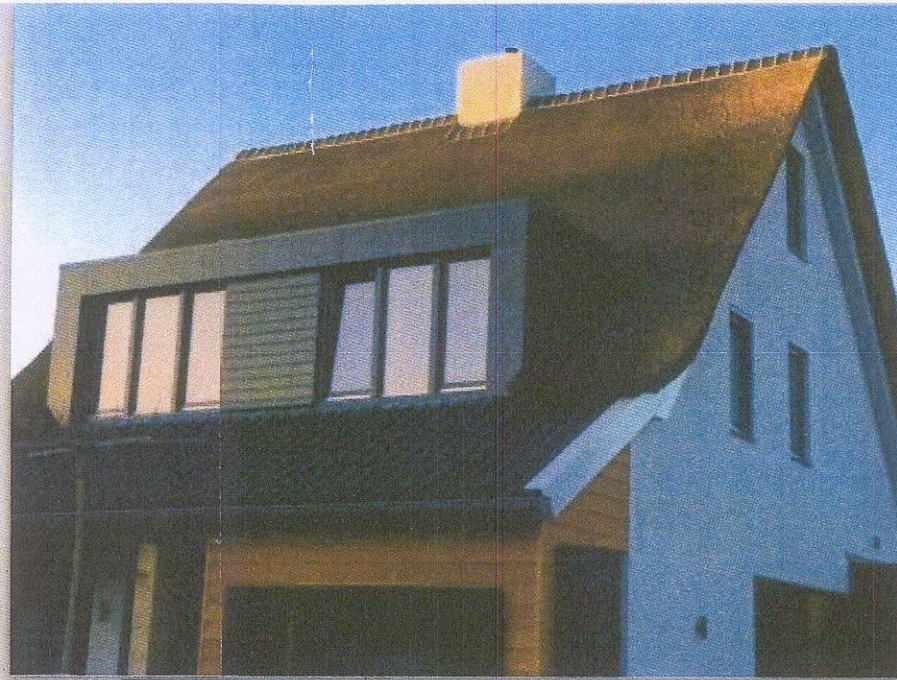
TYPICAL DORMER DETAIL

T.O Ridge beyond Existing roof slate New roof slate