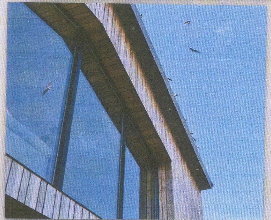
PROPOSED EAVES DETAIL TO GABLE END FACADE