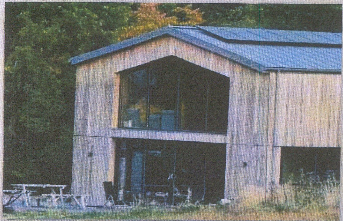
DESIGN CONCEPT FOR TIMBER CLADDING TO REAR ELEVATION