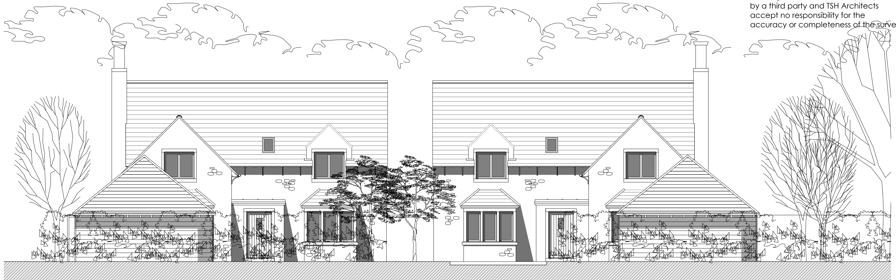
Street Elevation scale 1: 100

The survey information shown on this drawing is based on a survey prepared by a third party and TSH Architects accept no responsibility for the accuracy or completeness of the survey