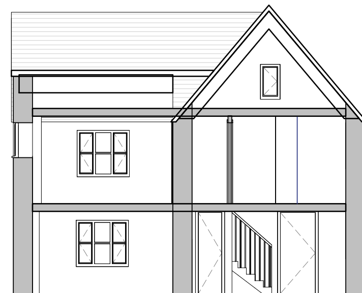
PROPOSED SECTION B_B