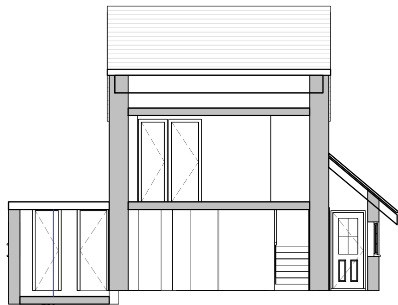
PROPOSED SECTION A_A