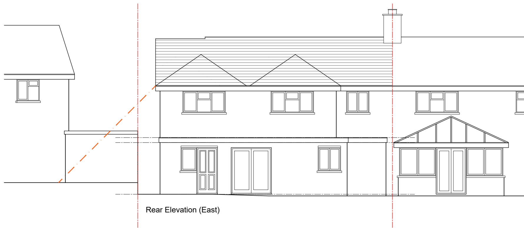
Rear Elevation (East)