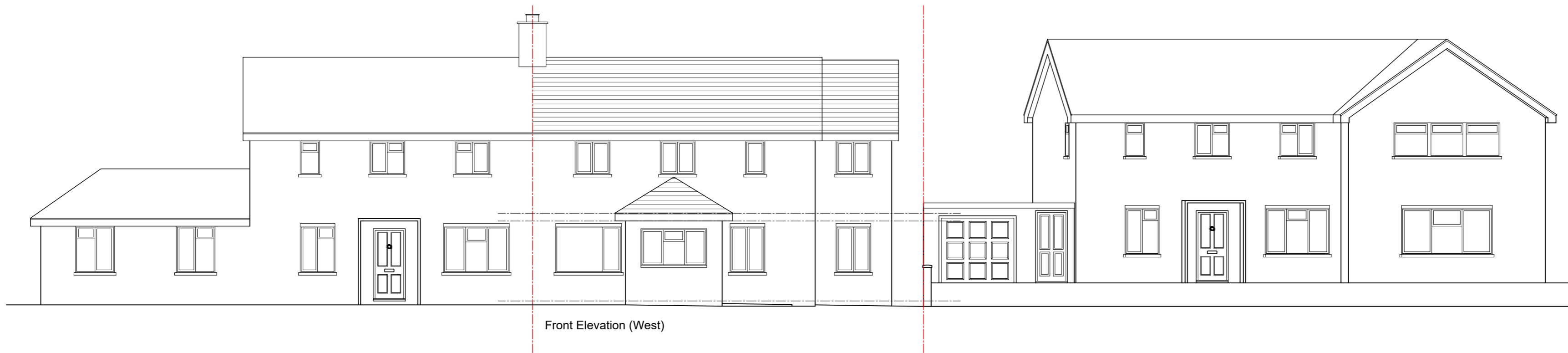
Front Elevation (West)