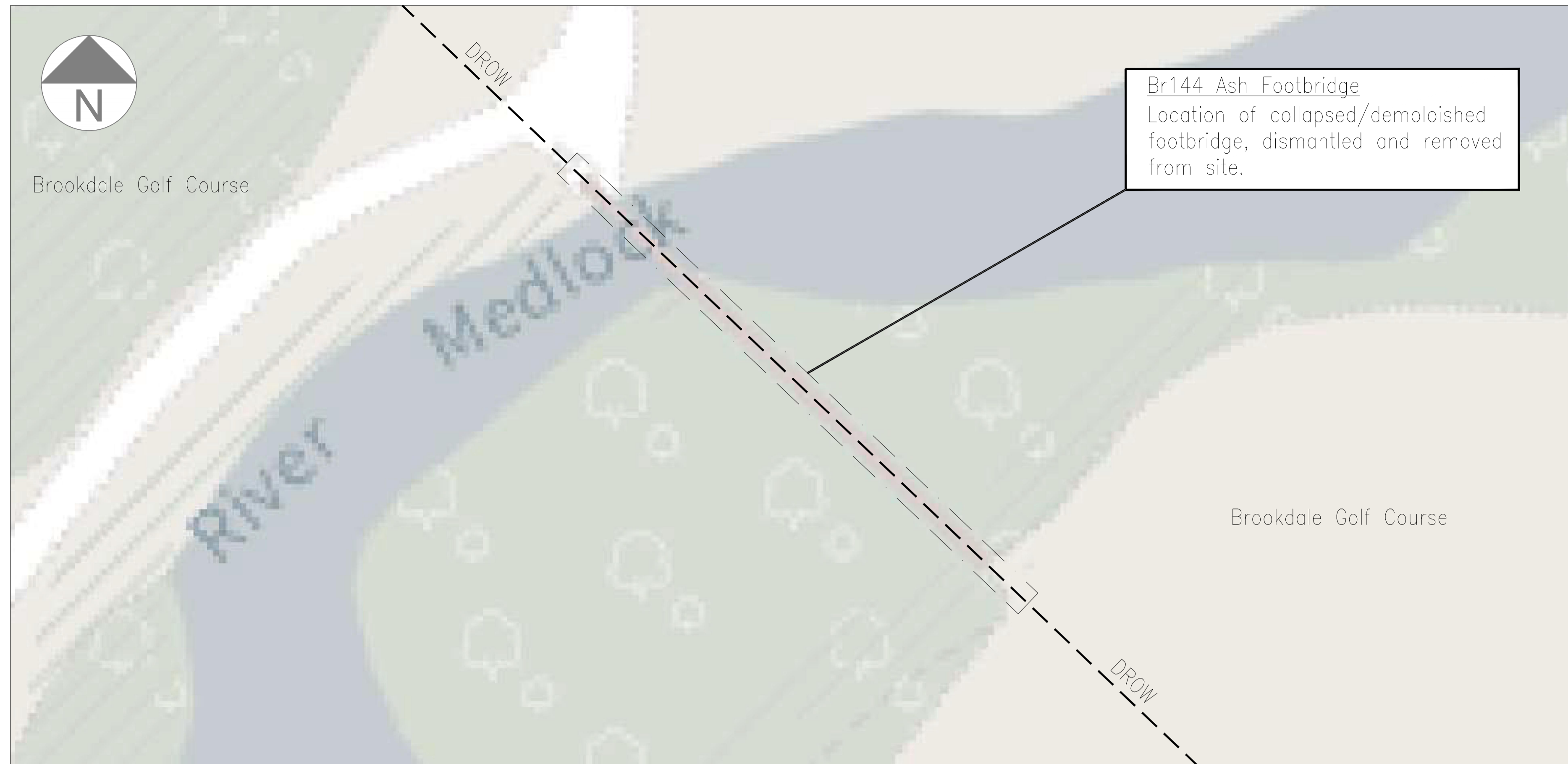
EXISTING SITE PLAN SCALE 1:200