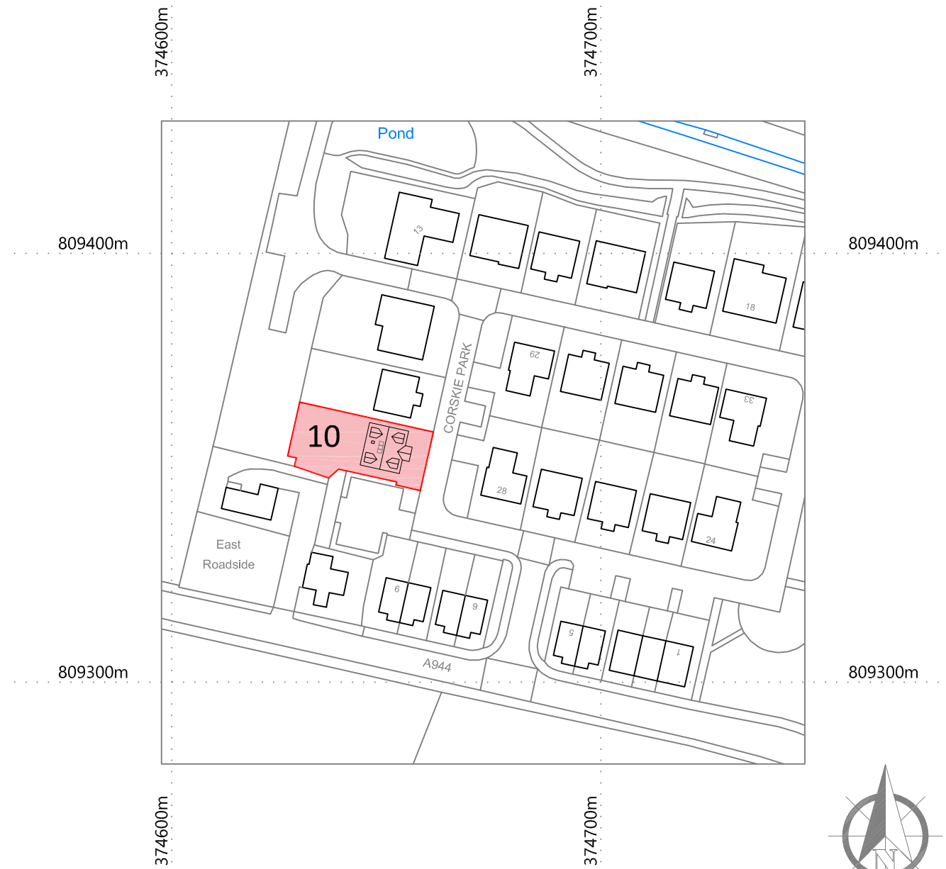
Location Plan scale 1:2500