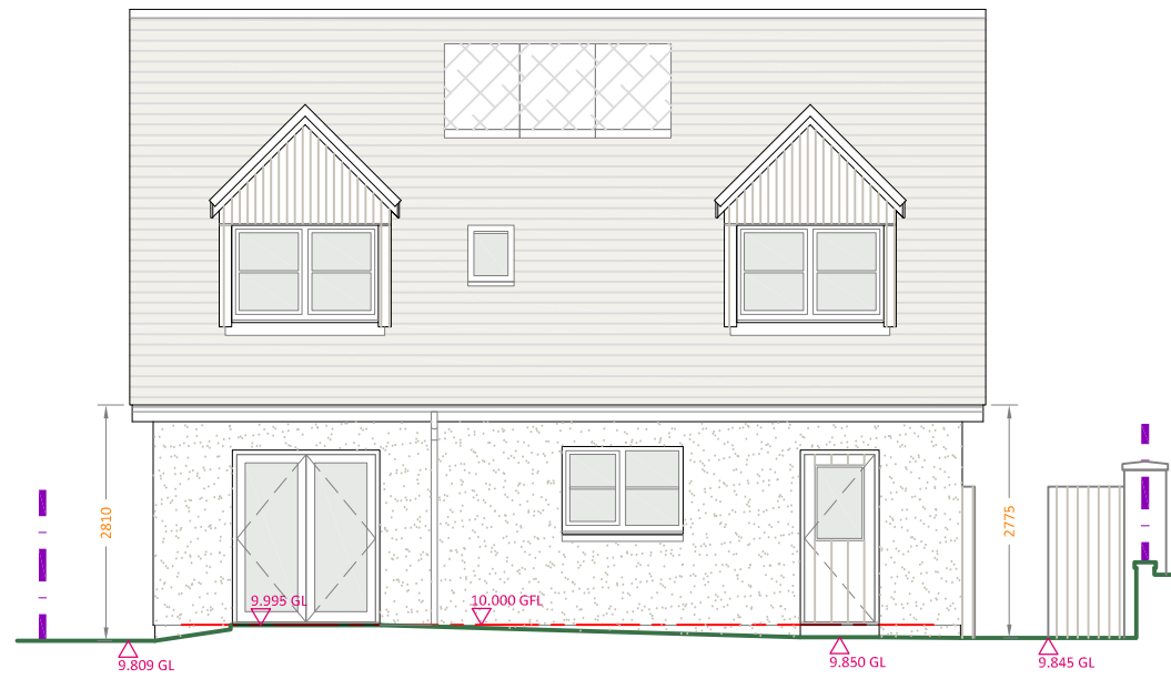
Existing West Elevation scale 1:100