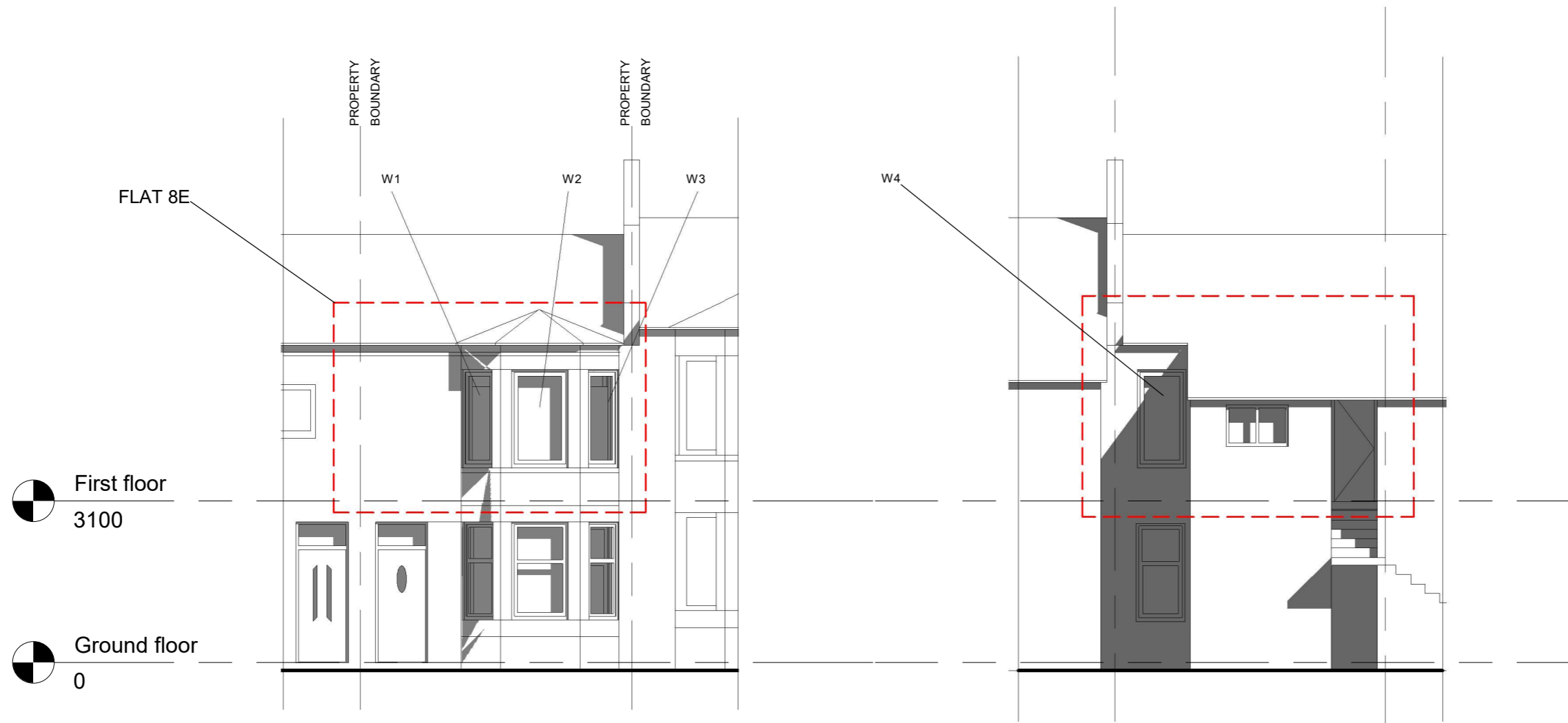
EAST (FRONT) ELEVATION