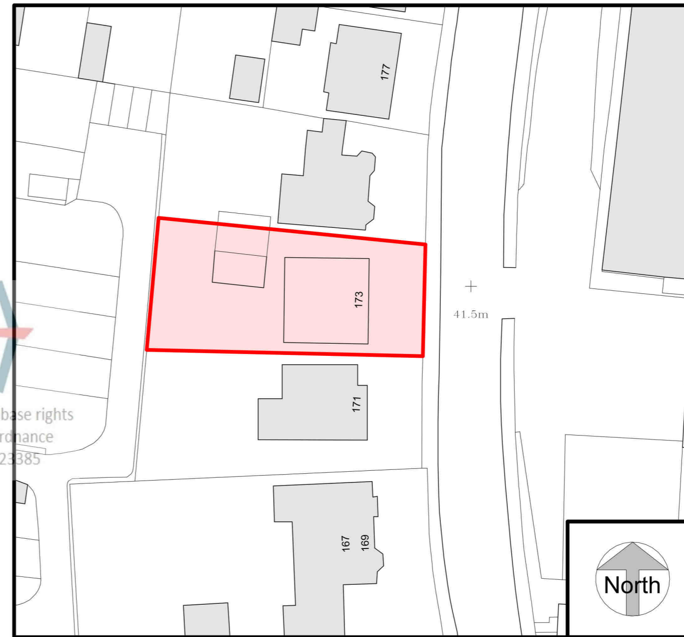
Block Plan 1 : 500