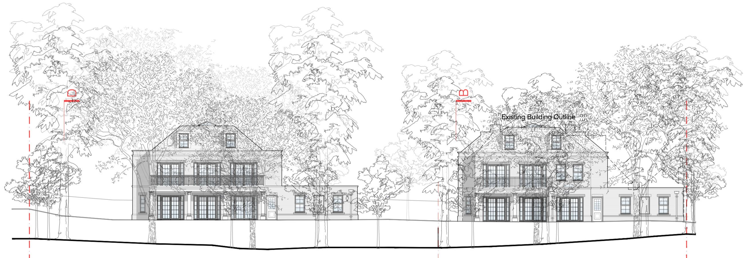
Proposed Site Section B-B Scale 1:200 @ A1