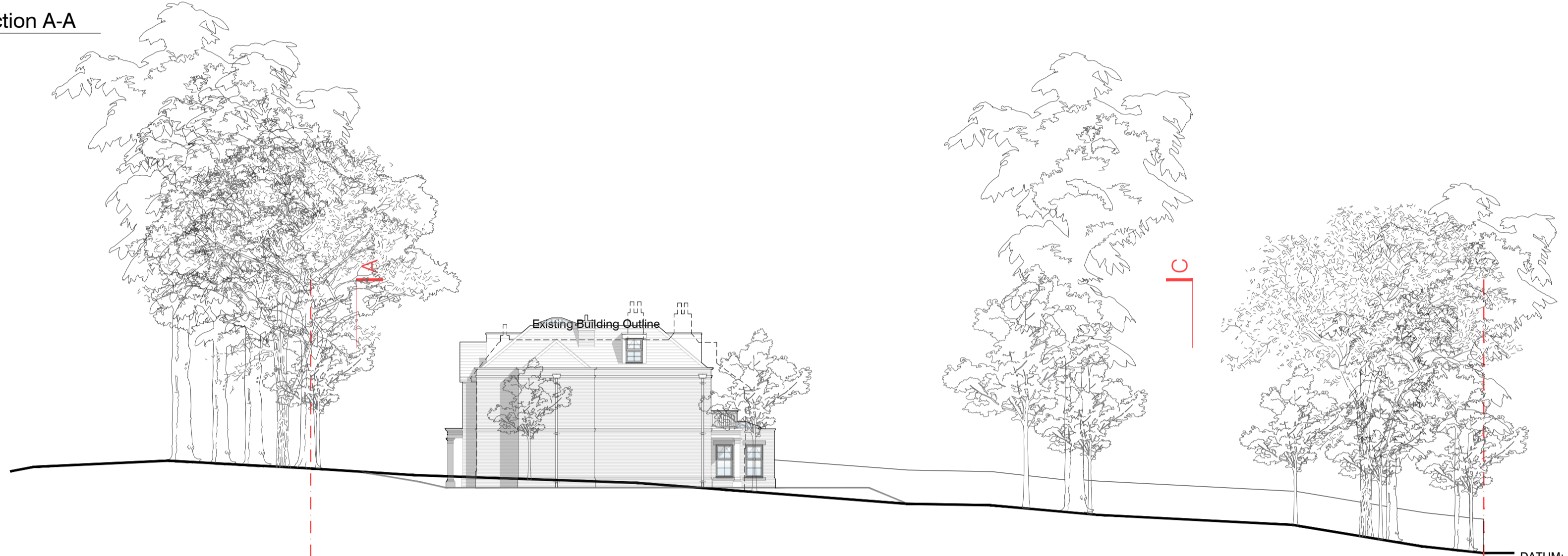
Proposed Site Section A-A Scale 1:200 @ A1