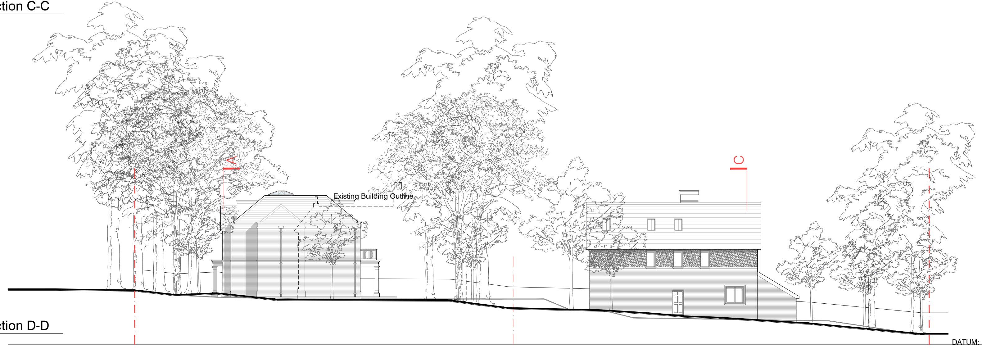
Proposed Site Section C-C Scale 1:200 @ A1