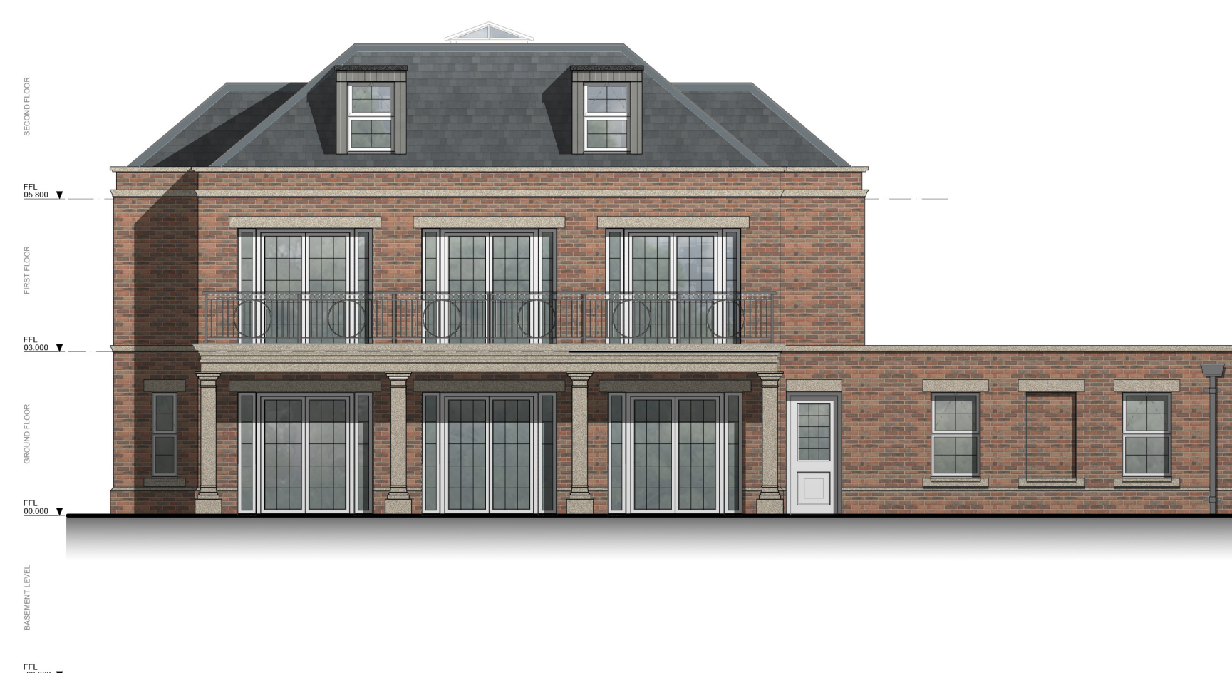
04 Proposed Side Elevation Scale 1:100 @ A1

Products and finishes shown indicatively only. Refer to contract documents for final specification and general arrangements.