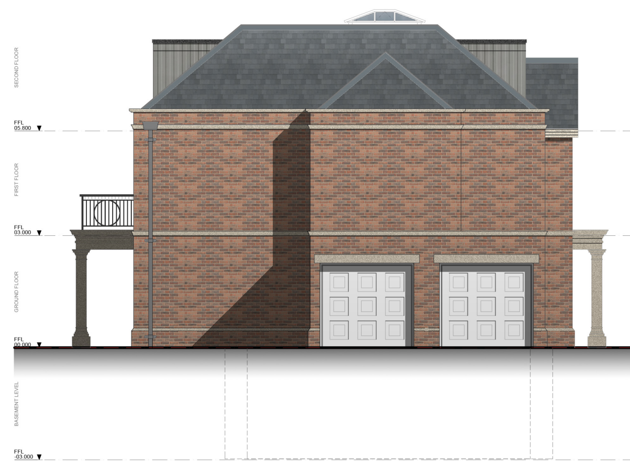
03 Proposed Side Elevation Scale 1:100 @ A1