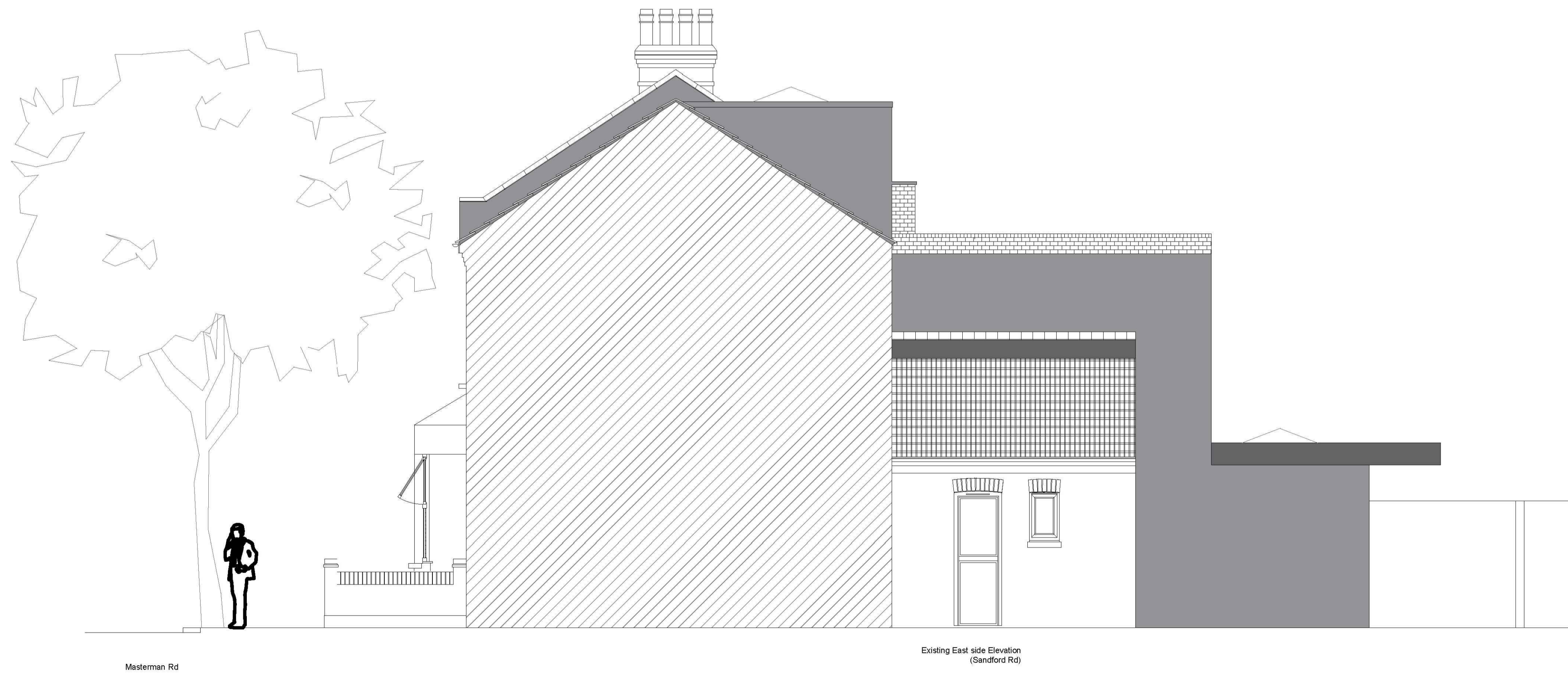
Masterman Rd Existing East side Elevation (Sandford Rd)