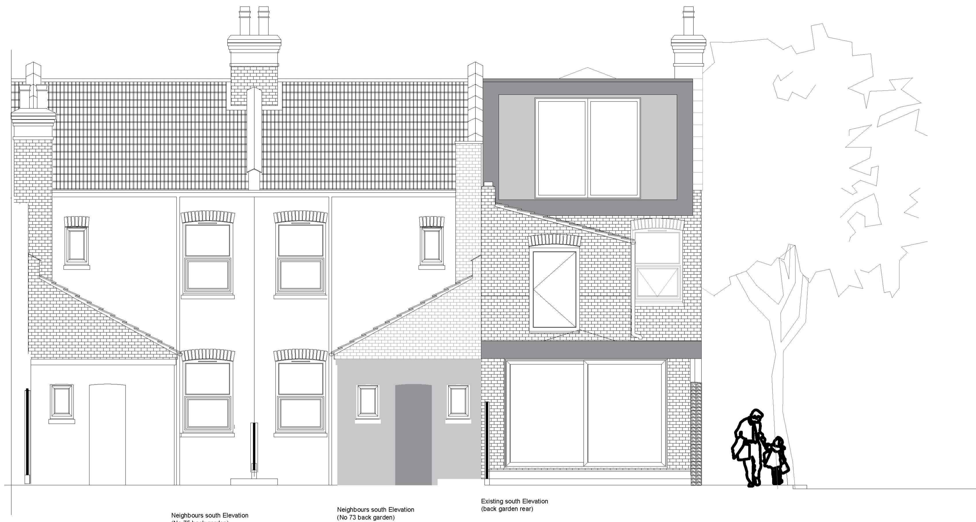
Neighbours south Elevation (No 75 back garden) Neighbours south Elevation (No 73 back garden) Existing south Elevation (back garden rear)