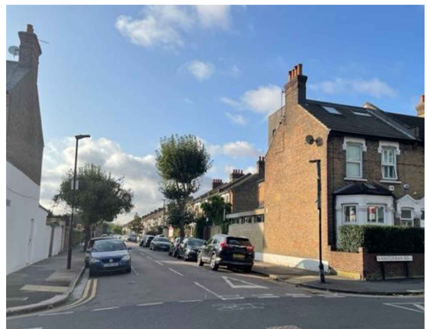
Photo - Existing side elevation - you cannot see the proposal