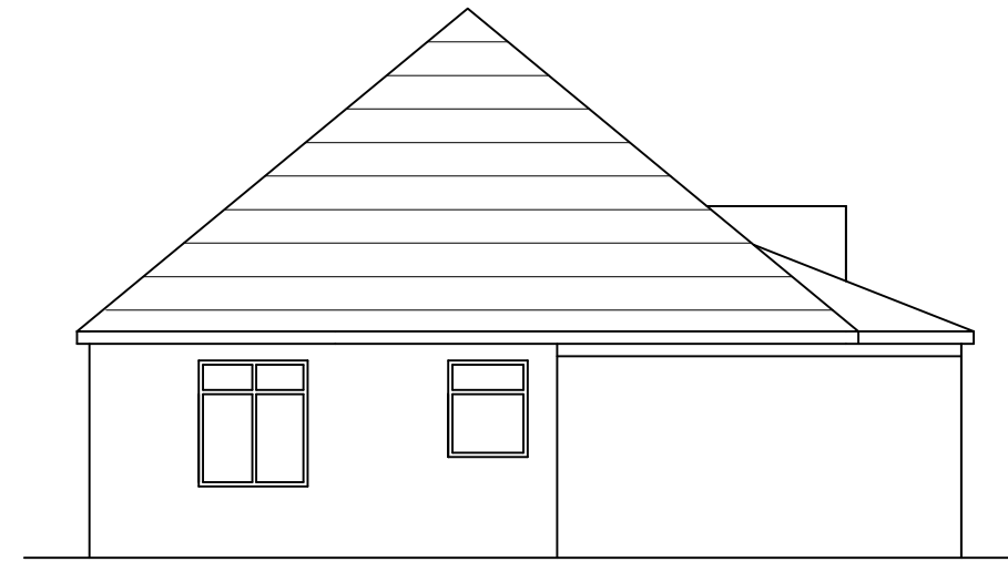
EXISTING SIDE ELEVATION 2