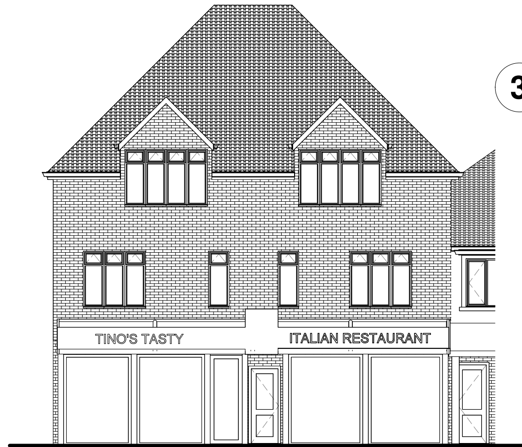
1 Existing Front Elevation 1 : 100