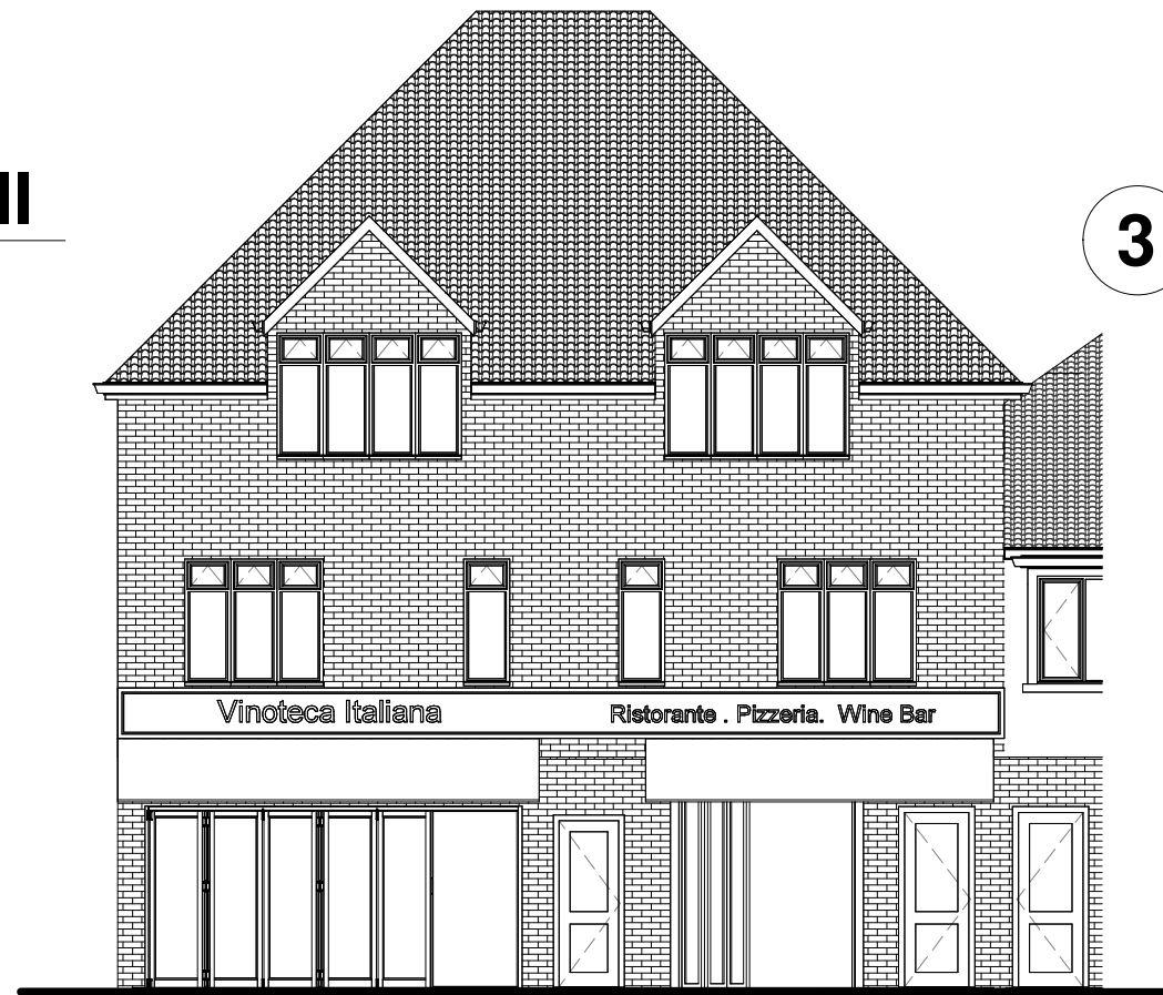
1 Pre-Existing Front Elevation 1 : 100