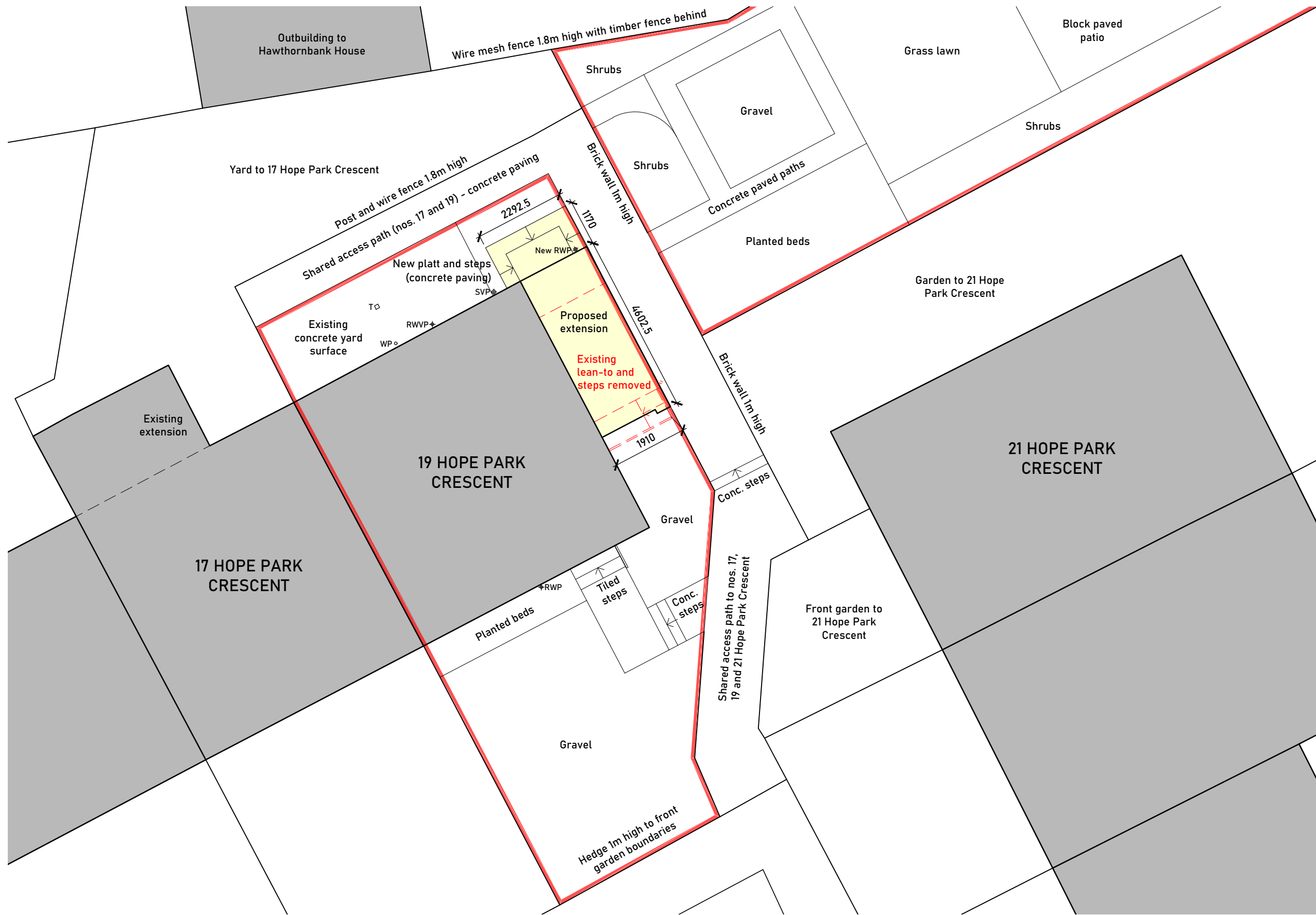
PROPOSED SITE PLAN - 1:100