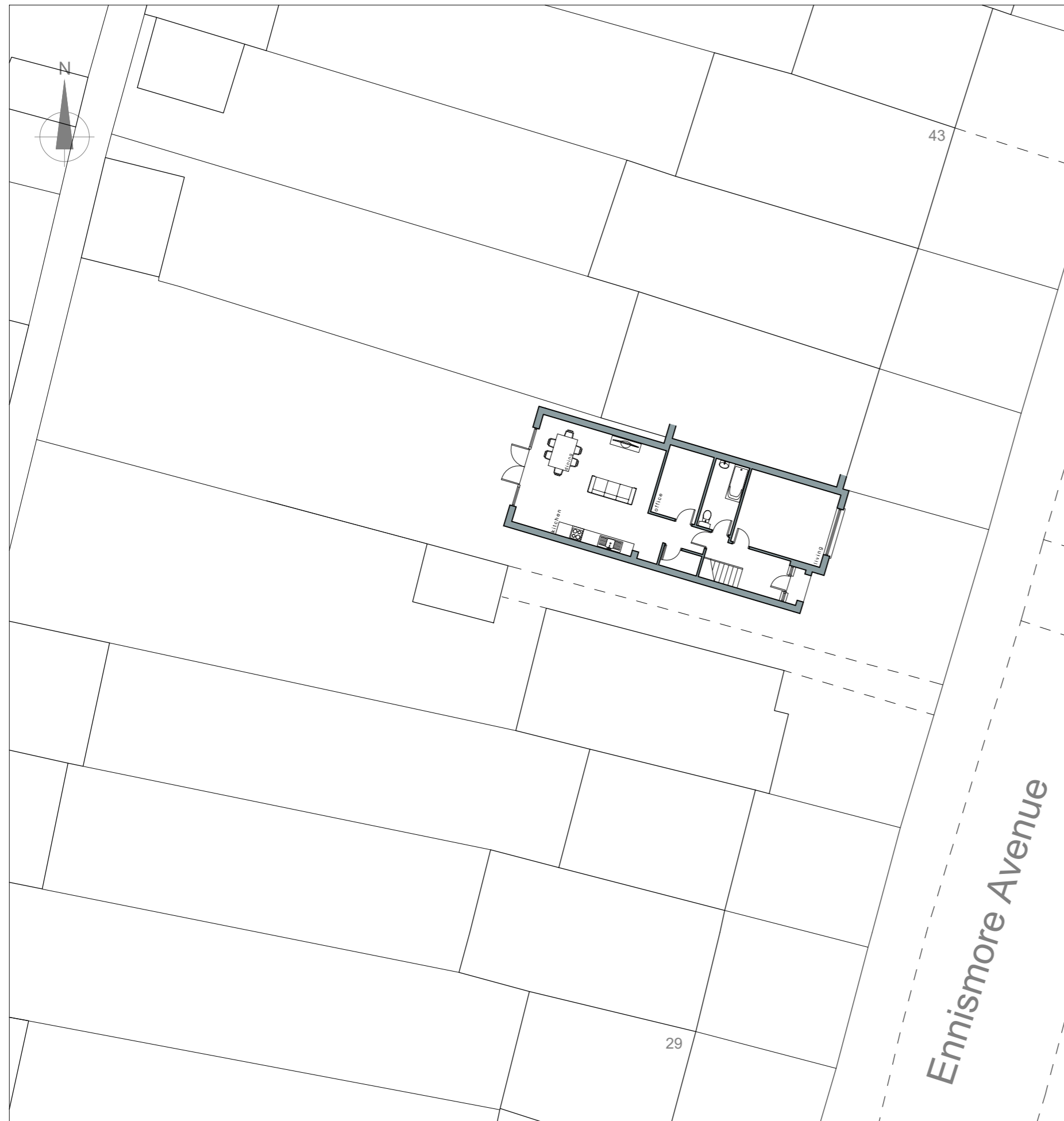
existing site block plan scale 1:200