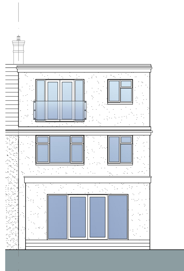
rear elevation scale 1:100