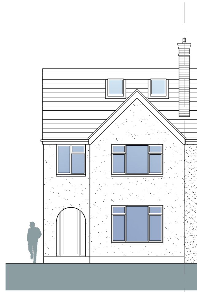
front elevation scale 1:100