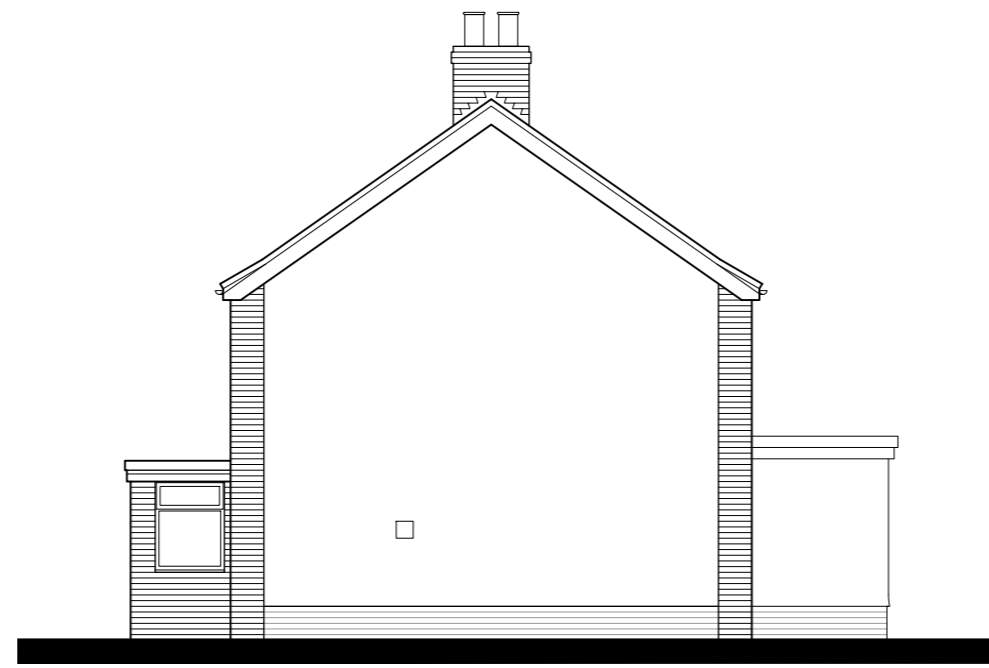
Side Elevation 1:100