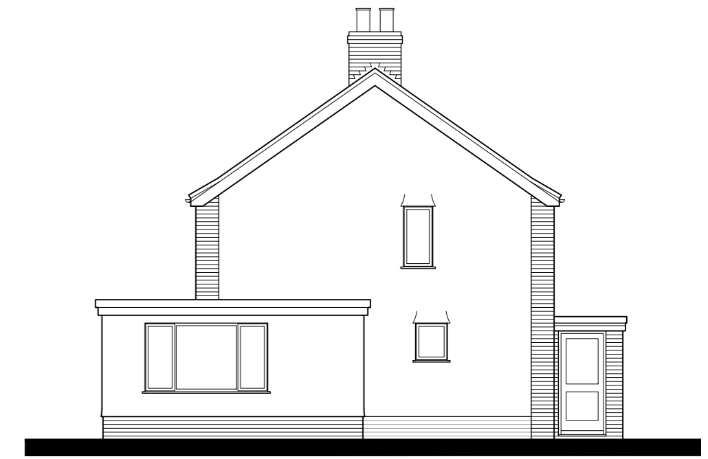
Side Elevation 1:100