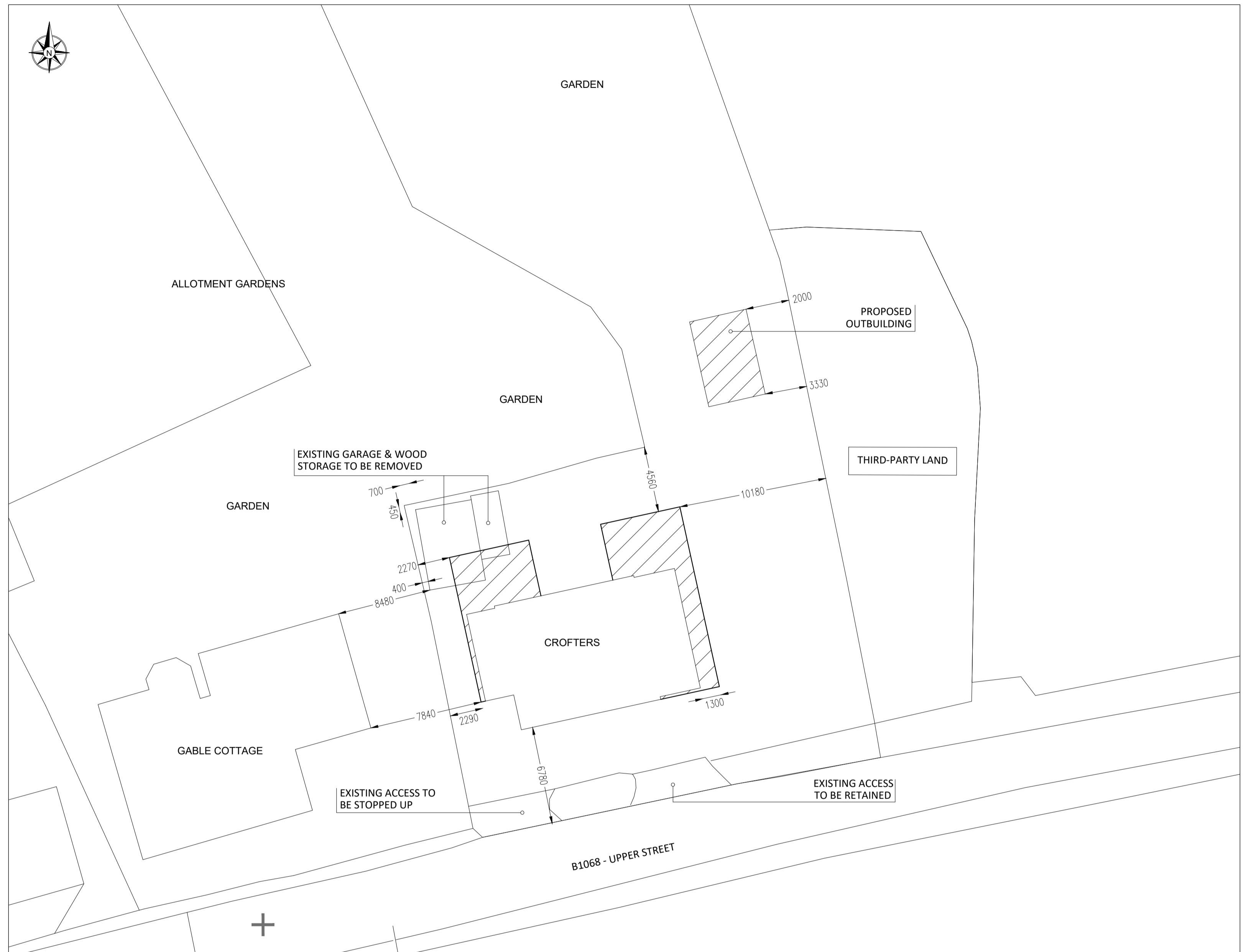
BLOCK PLAN (1:200)