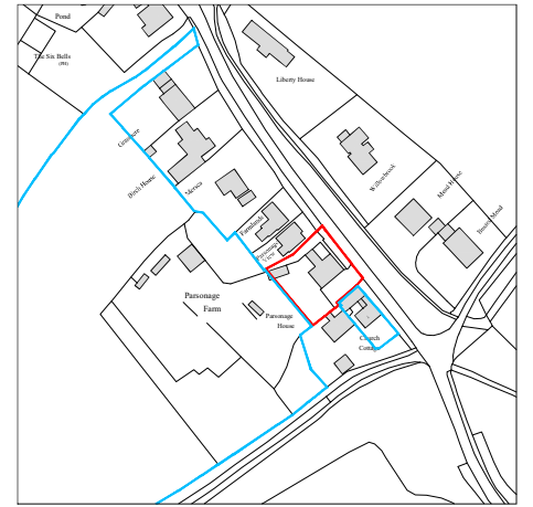
Location Plan Scale: 1:1250