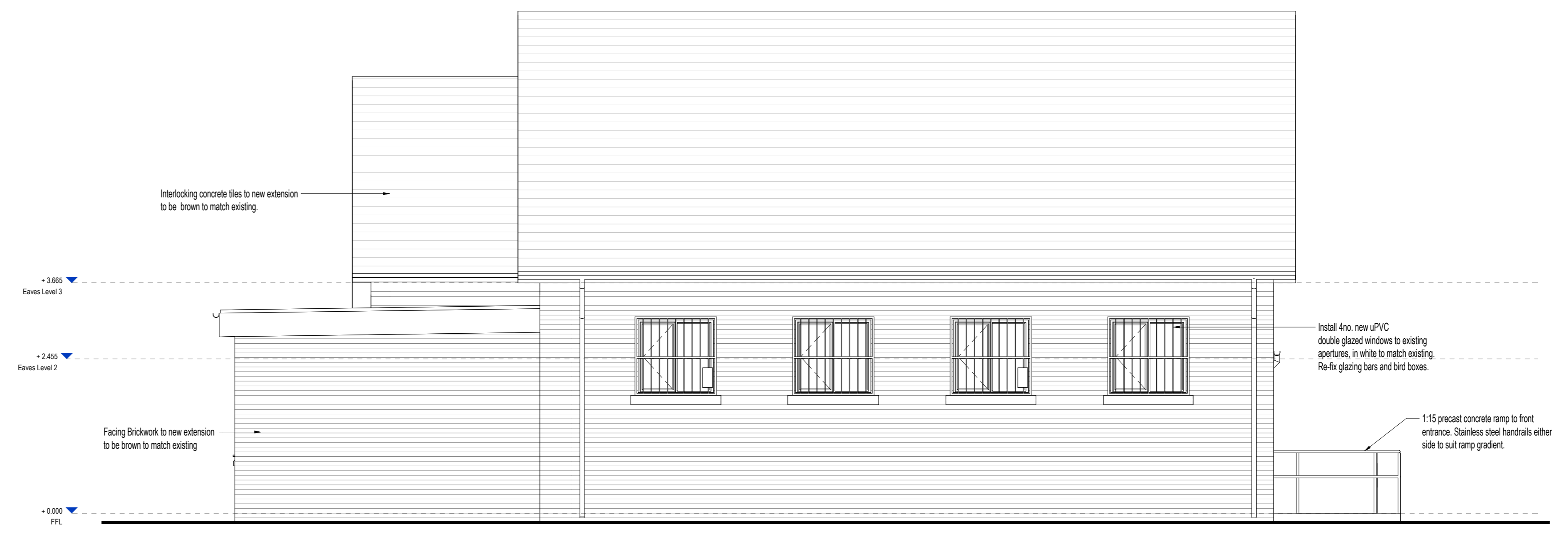
NE Elevation - Proposed 1:50