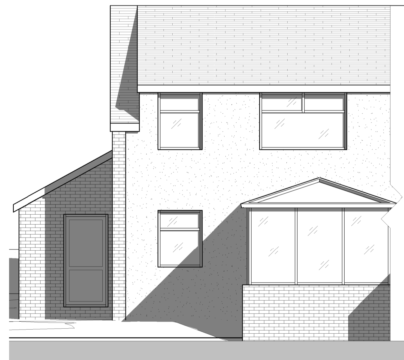
Proposed Front Elevation 1:50