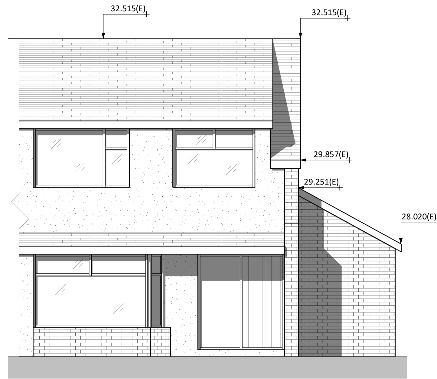
Proposed Rear Elevation 1:50