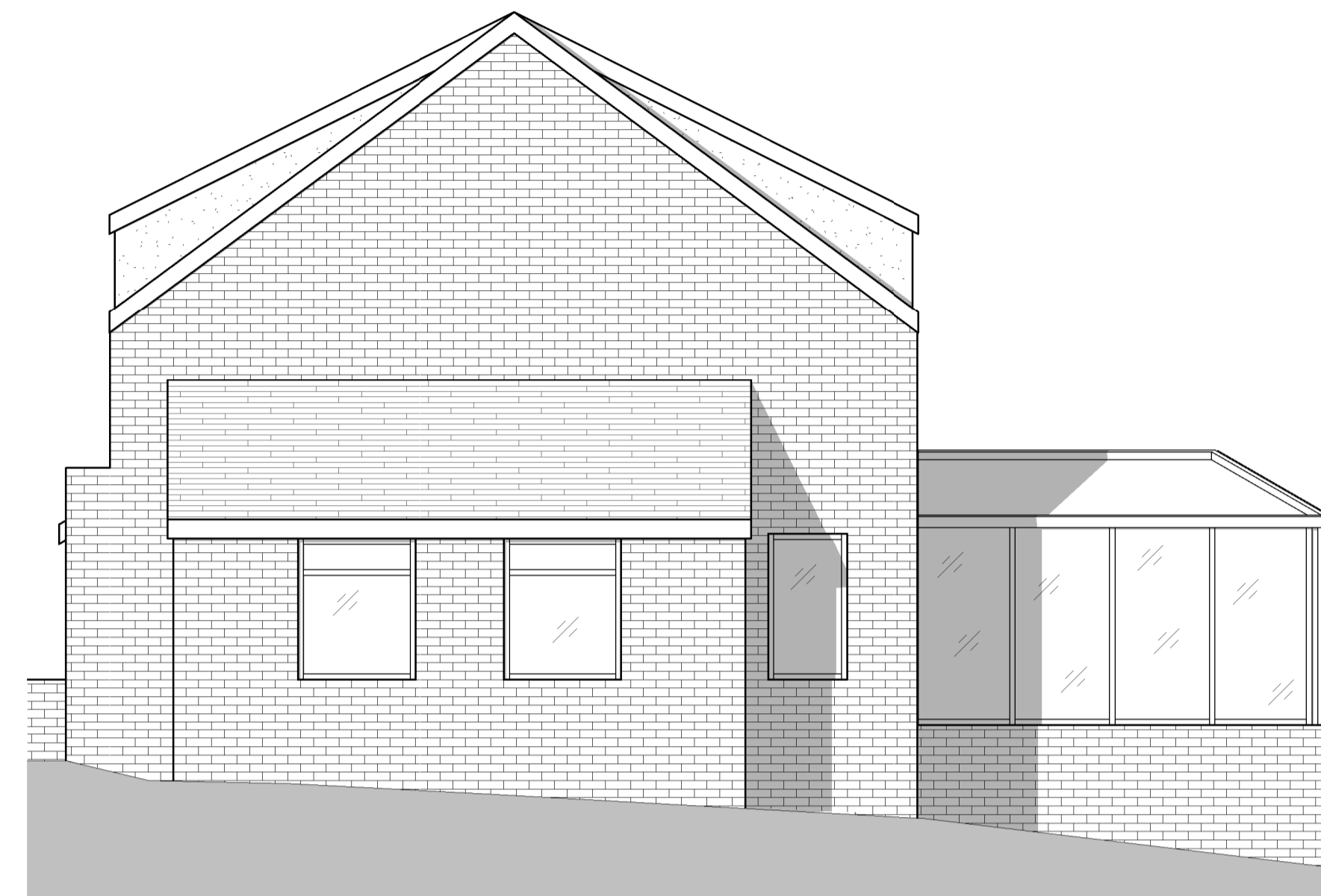
Proposed Left Elevation 1:50