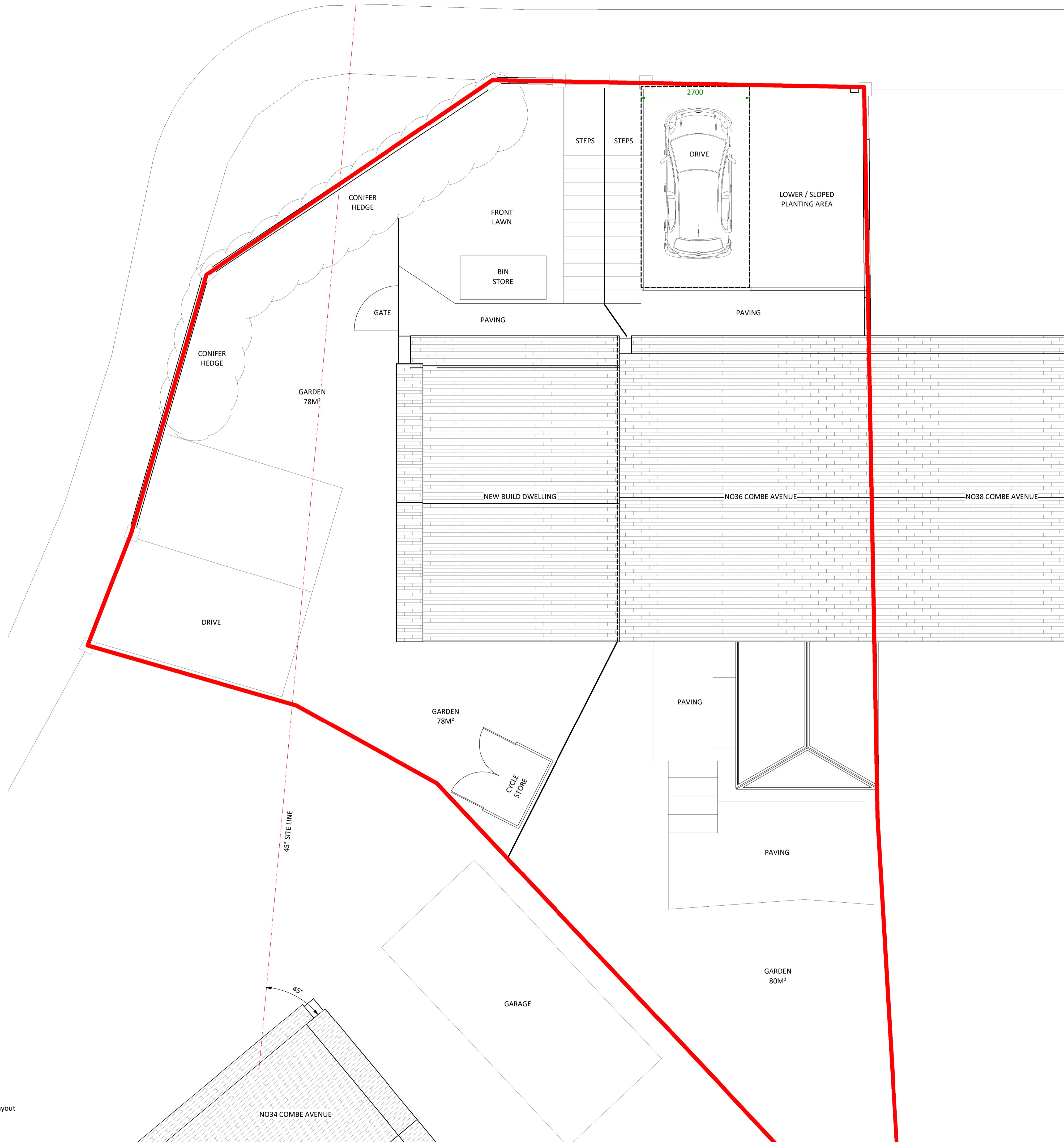
Proposed Site Layout 1:50