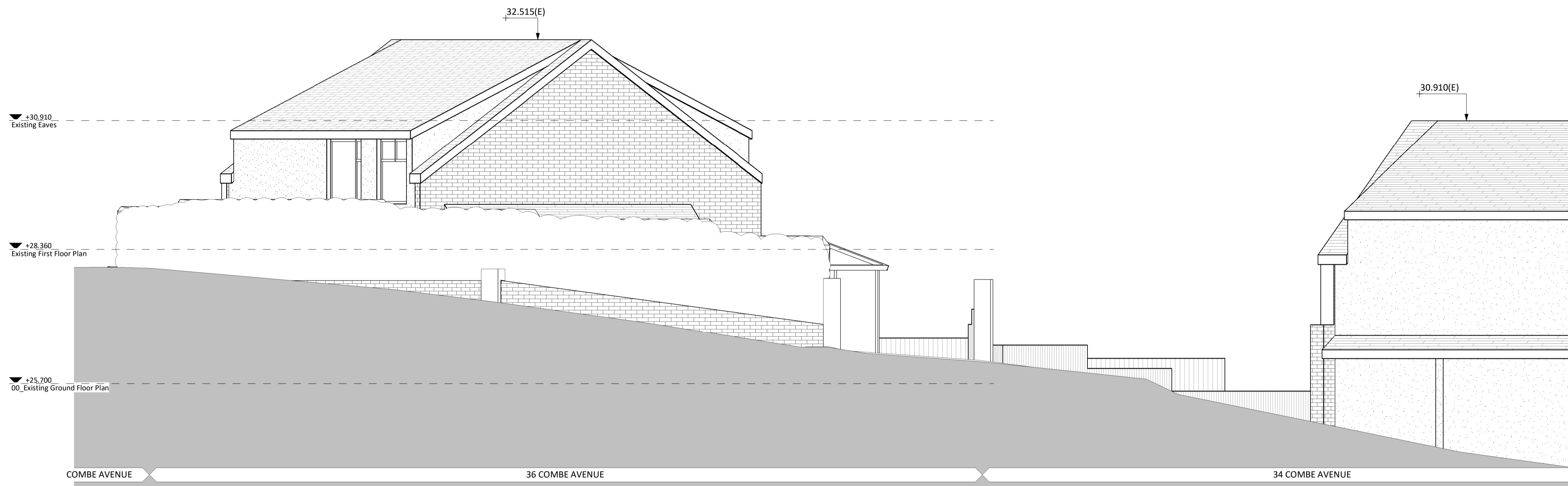
Existing Side Facing Street Elevation 1:50