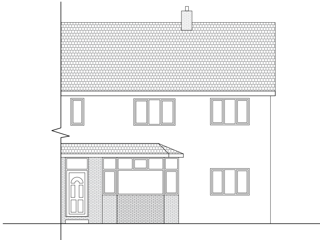
EXISTING FRONT ELEVATION SCALE 1: 100