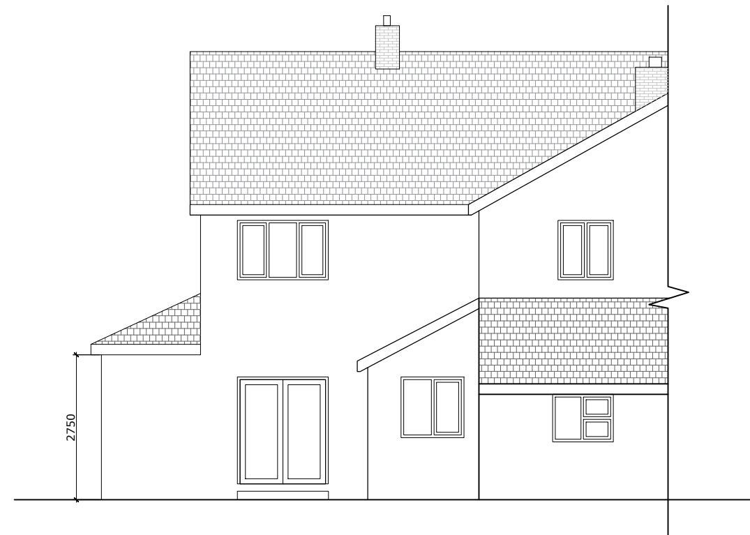
PROPOSED REAR ELEVATION SCALE 1: 100