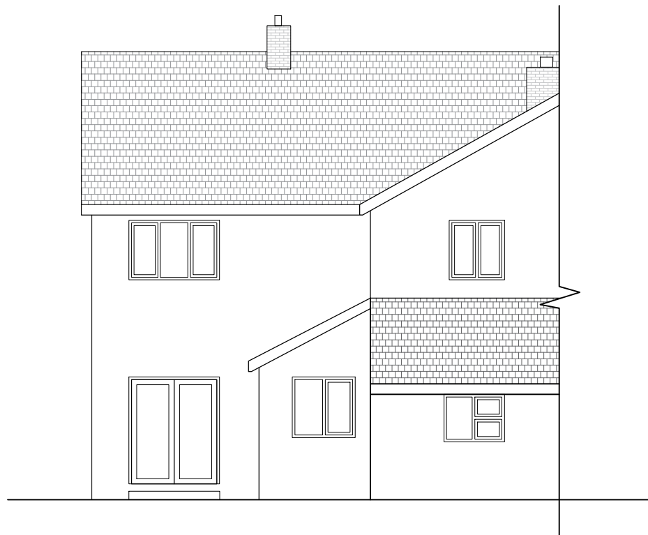
EXISTING REAR ELEVATION SCALE 1: 100