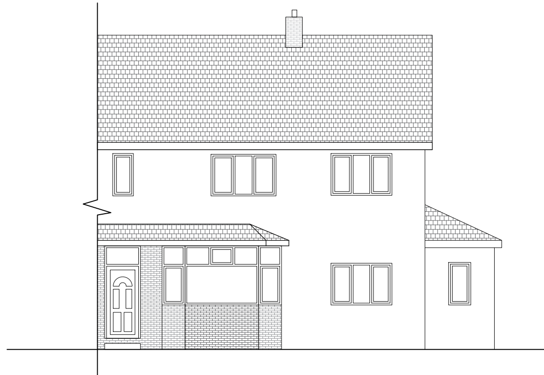
PROPOSED FRONT ELEVATION SCALE 1: 100