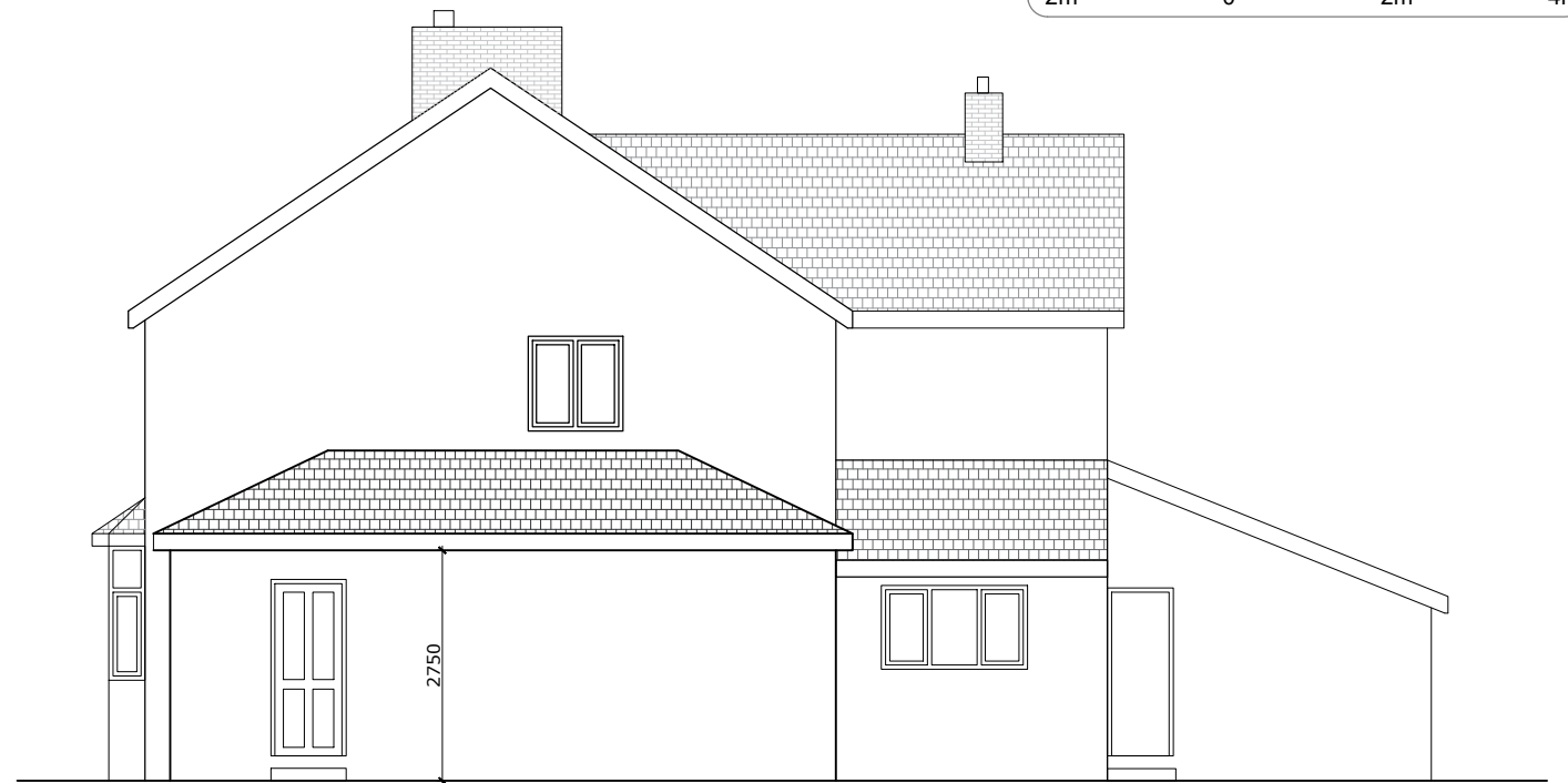
PROPOSED RIGHT SIDE ELEVATION SCALE 1: 100