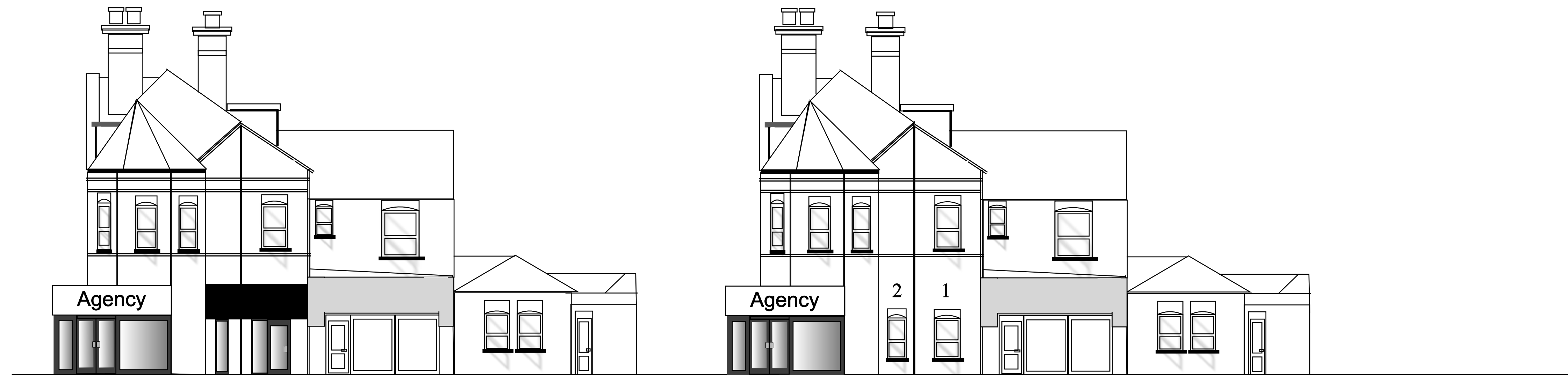
Corner Elevation Proposed

Front Elevation Install new window and door (1) to form new access. Increase size of original window (2) to full height . Remove stud wall and form new storage room toilet and Reception area(3).