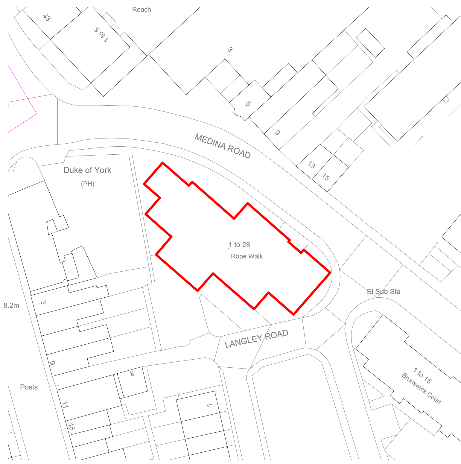
Block Plan - Scale 1:500