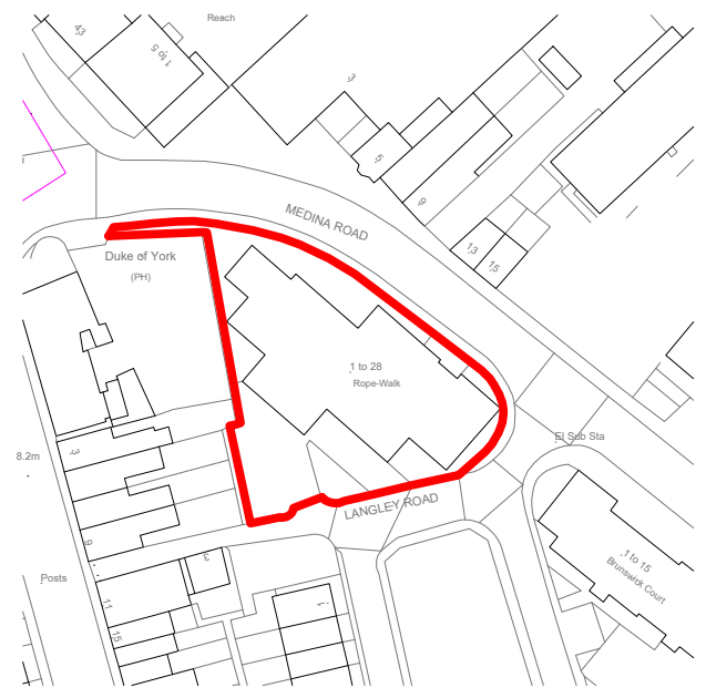
Site Plan - Scale 1:1250