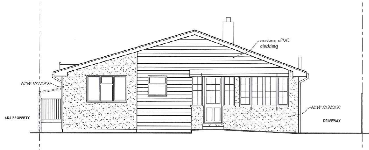
FRONT ELEVATION - East

Pitched Roof - tile to match existing. Flat Roof - dark grey single ply membrane. Walls - white render finish with facing brick plinth. Windows & Doors - double glazed, white uPVC to match existing.