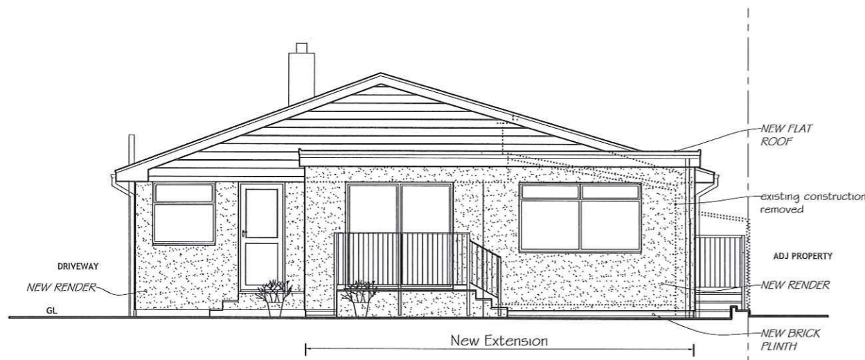
REAR ELEVATION - West