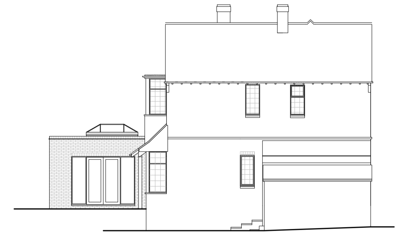
SIDE ELEVATION (EAST) 1:100 0 2 4 6 8 10m