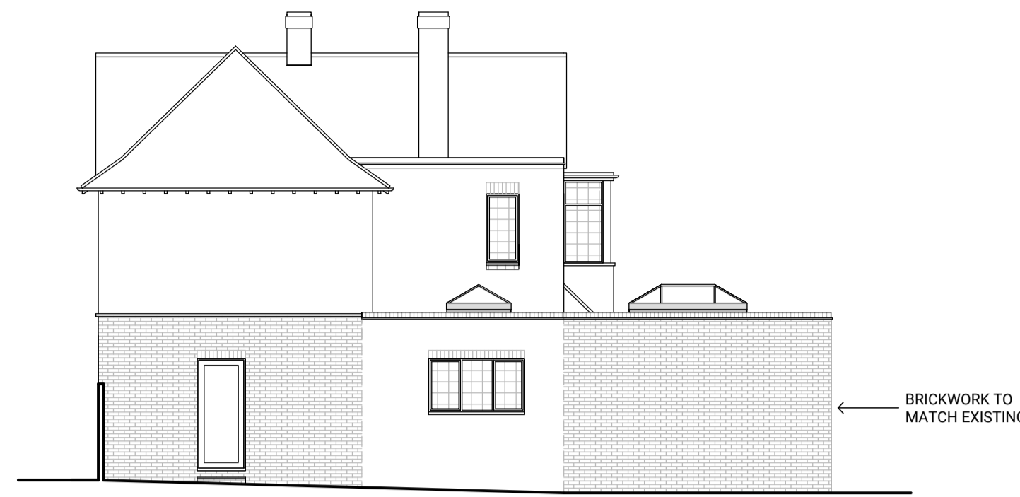
SIDE ELEVATION (WEST)