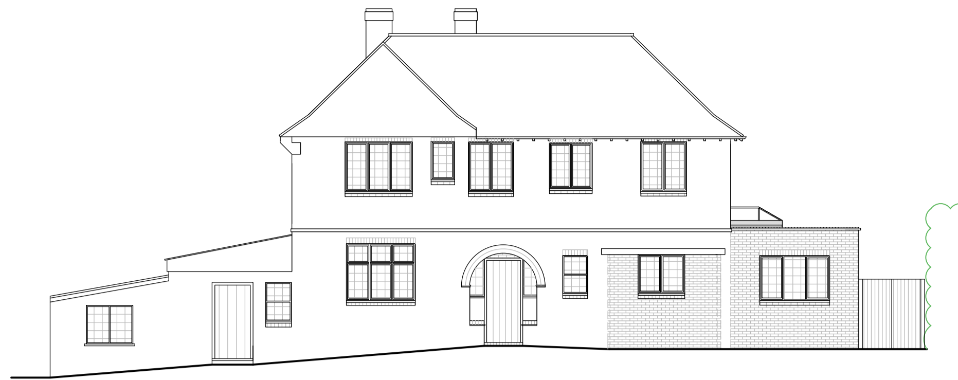
FRONT ELEVATION (NORTH)

GENERAL NOTES ALL DIMENSIONS TO BE CHECKED ON SITE PRIOR TO COMMENCEMENT OF WORKS - PLEASE REPORT ERRORS OR OMISSIONS TO THE ARCHITECT. THIS DRAWING HAS BEEN PRODUCED FOR THE PURPOSES OF PLANNING AND BUILDING REGULATIONS APPROVALS ONLY AND IS NOT INTENDED TO BE A FULL WORKING DRAWING. THIS DRAWING IS TO BE READ IN CONJUNCTION WITH ANY WRITTEN SPECIFICATIONS, SCHEDULES OF WORK AND STRUCTURAL ENGINEERS DETAILS AS APPROPRIATE. THIS DRAWING IS THE COPYRIGHT OF PUMP HOUSE DESIGNS AND ANY FURTHER REPRODUCTION OF THE PLAN IS NOT PERMITTED WITHOUT OBTAINING PRIOR CONSENT. © CROWN COPYRIGHT 2023 - LICENCE NO. 100032237