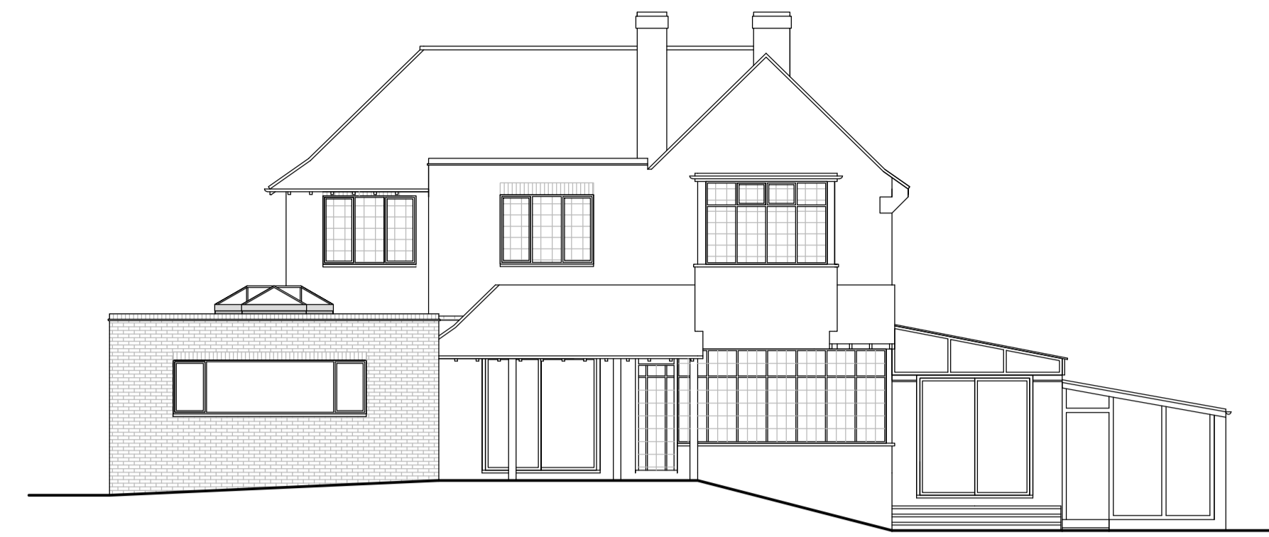
REAR ELEVATION (SOUTH)