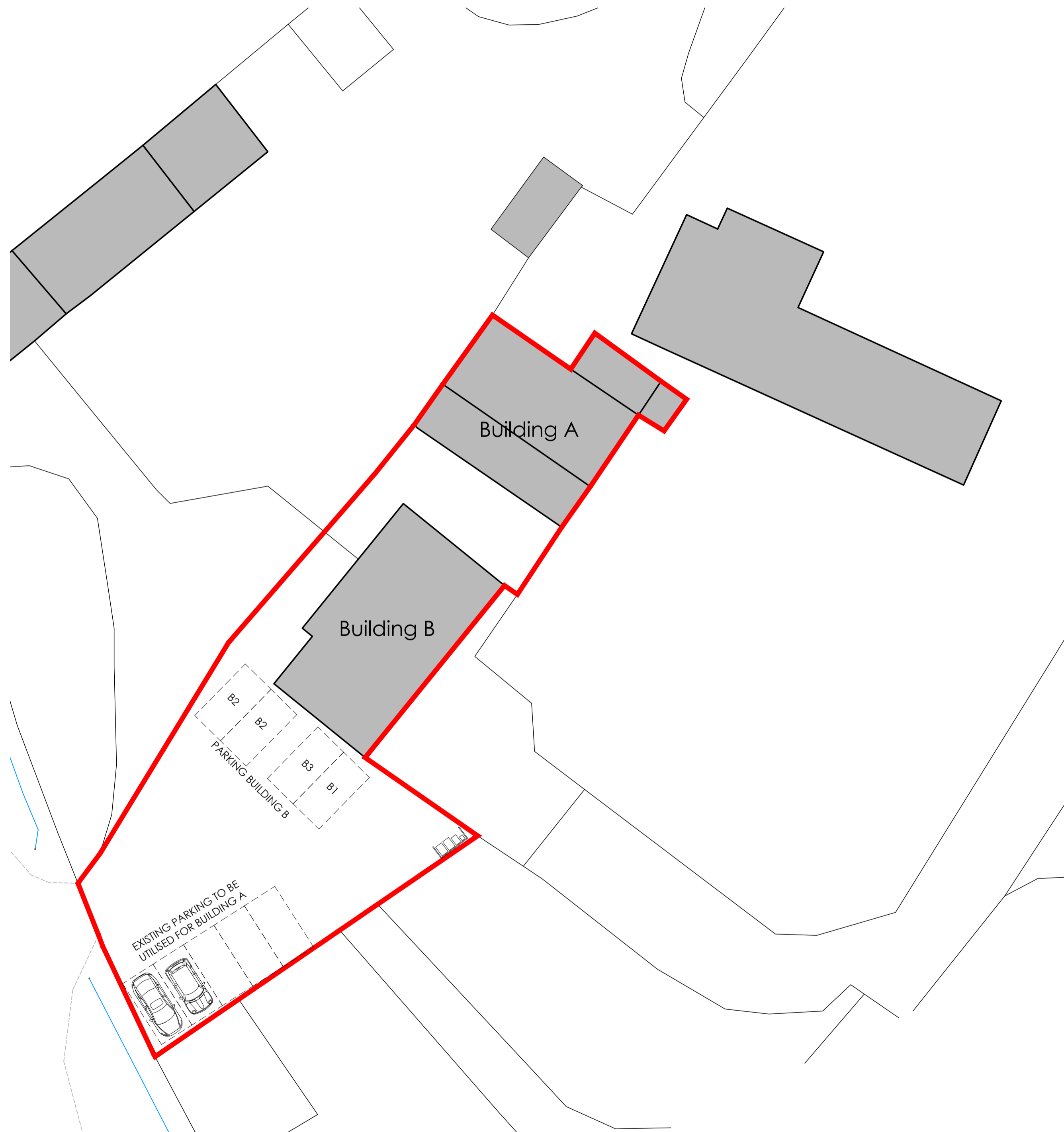
Proposed parking plan Scale 1:200