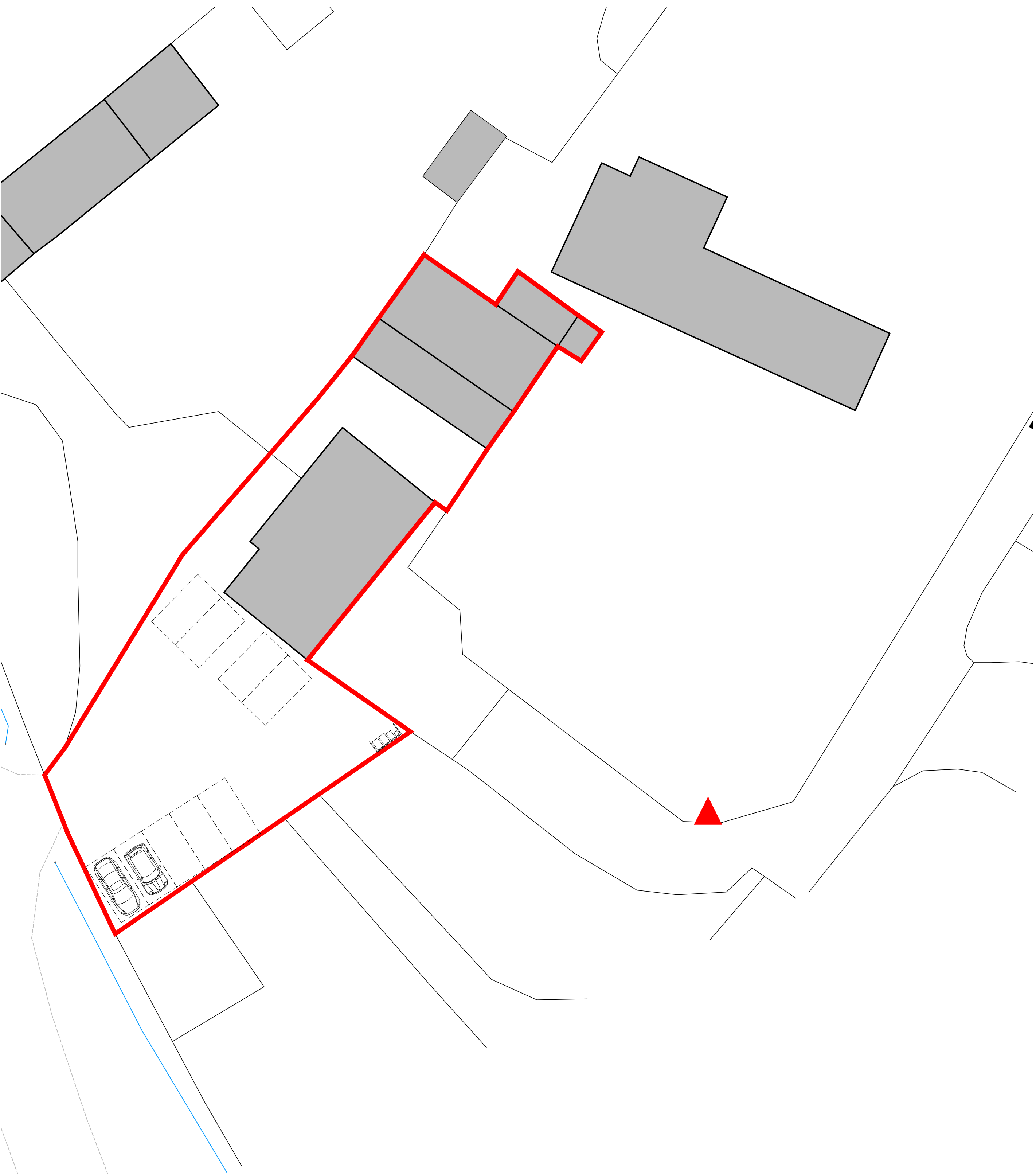
Proposed bat mitigation measures Scale 1:200