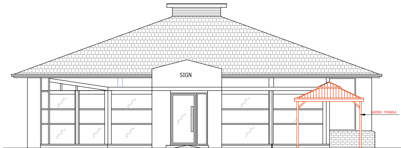
EXISTING FRONT ELEVATION (SOUTH WEST) SCALE:1/100

THE CONTENTS OF THIS PLAN INCLUDING THE PRINTED NOTES ARE COPYRIGHT AND REPRODUCTION IN WHOLE OR PART IS NOT PERMITTED WITHOUT PRIOR CONSENT OF SAYAR DESIGN IN WRITING