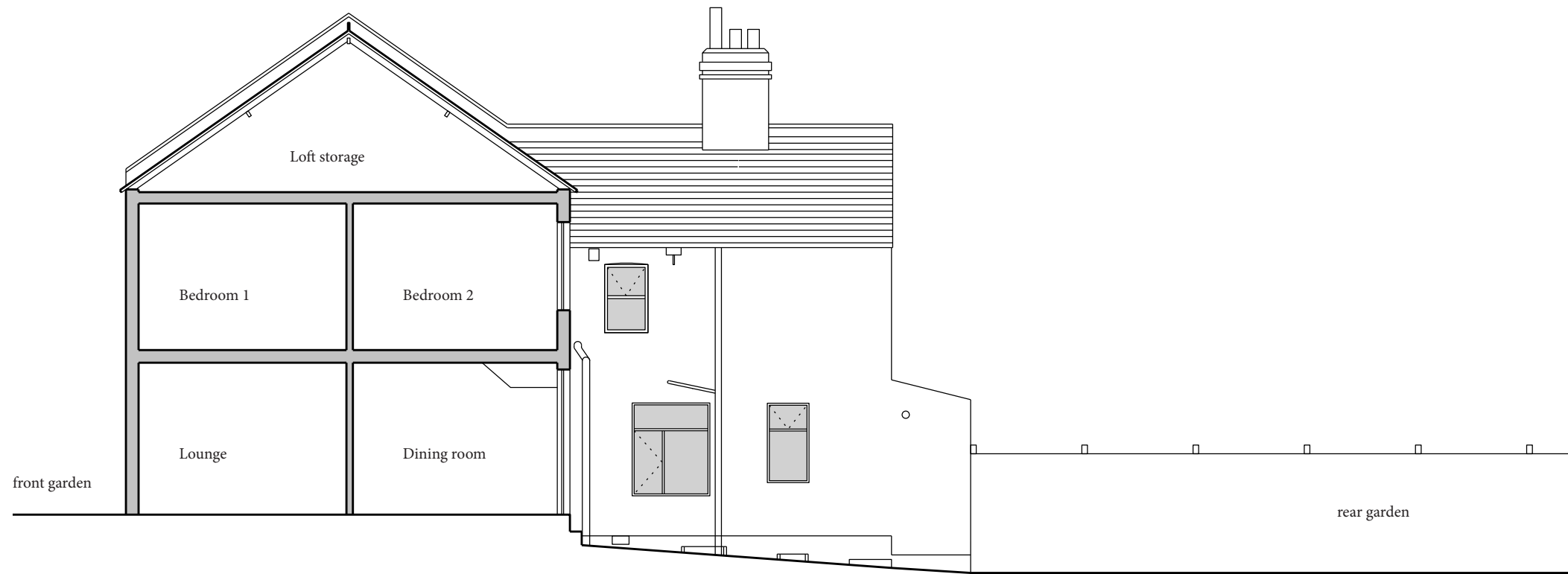
01- Existing Long Section AA