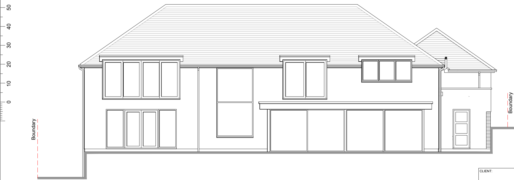
Existing rear elevation 1:100

Dashed line is approximate street/road level