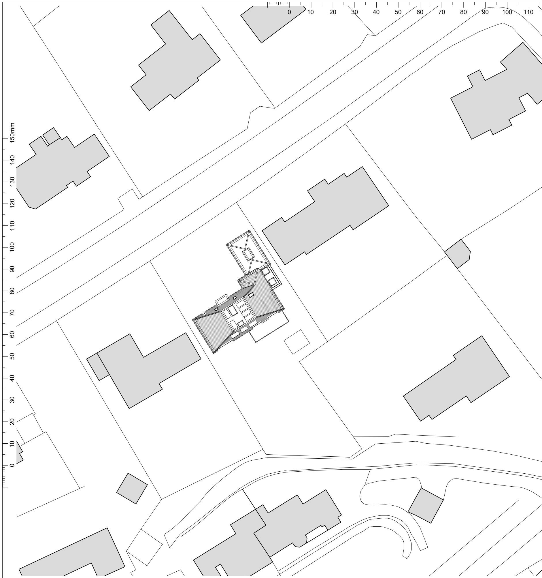
Block Plan 1:500 - Showing proposed new roof